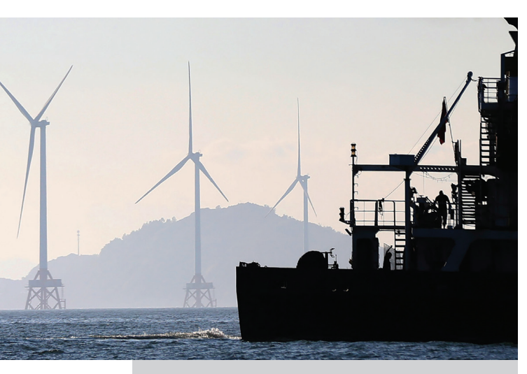
Climate change becomes a central priority for the China's 14th Five-Year Plan based on green and lowcarbon development.

Energy that is clean, low-carbon, safe, and efficient will take place among important areas that will be supported towards this goal. Moreover, an innovation-driven development strategy is being pursued while strengthening basic research and promoting interdisciplinary integration, including through common technology platforms. Accelerating strategic emerging industries, including new materials, green technologies, and infrastructure for smart energy systems is being targeted. Long-term goals for 2035 include new types of urbanization and green production for more sustainable development towards an ecological civilization that is centered on people and harmonious coexistence with nature. Resource utilization efficiency, as well as high-quality development for the Belt and Road region is further emphasized among the 60 proposed points (Xinhua News Agency, 2020).