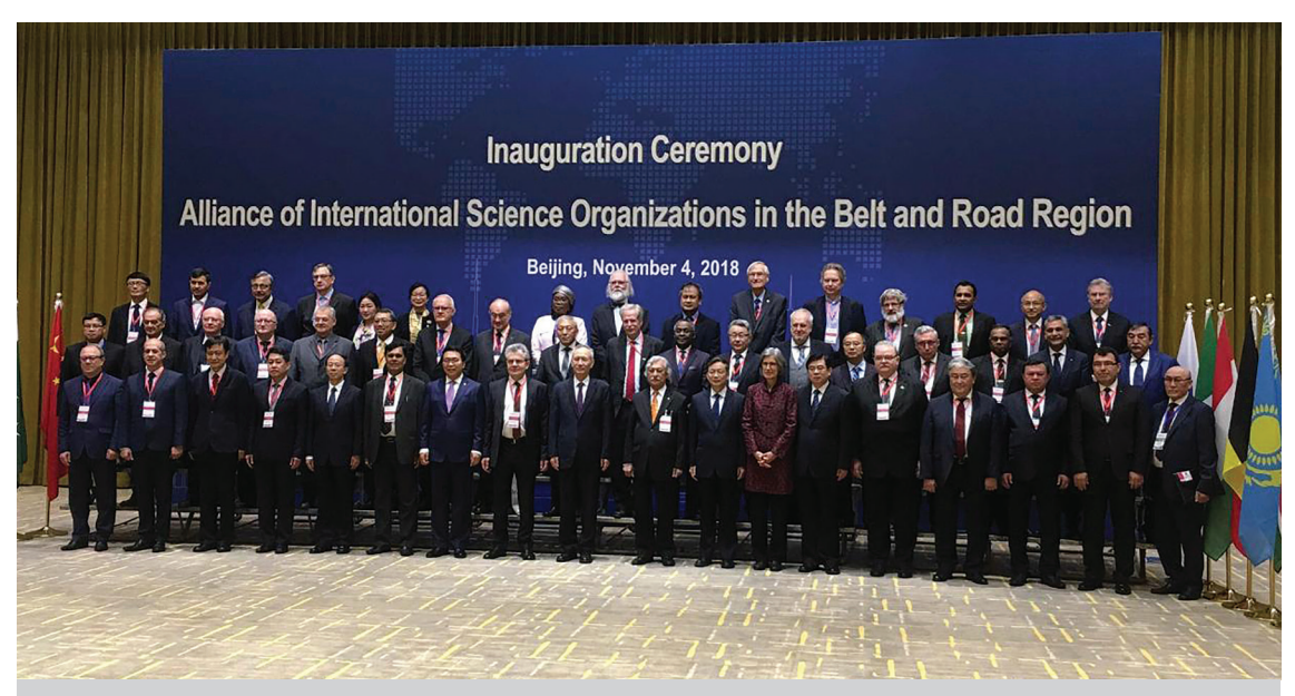
TUBITAK joined ANSO in 2018 as a founding member.

According to the most recent statistics, R&D personnel in full-time equivalents (FTE) has reached 4.8 million, with R&D as a share of gross domestic product (GDP) 2.23% in China (National Bureau of Statistics of China, 2020). In addition, researchers in FTE per million inhabitants are 1224.8 (UN, 2021). An important aspect of achieving the goals and targets for a shared and sustainable future will be based on directing this significant potential towards sustainability impacts in China and the collaborating countries in the Belt and Road Initiative. In the context of the SDGs, indicators that are being monitored for all countries include the renewable energy share in total final energy consumption (FEC), the energy intensity level of primary energy in megajoules per constant GDP, and indicators for environmental management, including electronic waste recycling (UN, 2021).