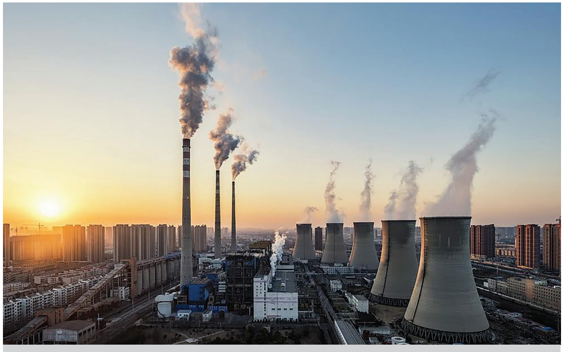
China aims for carbon neutrality by 2060. (CGTN, 2021)

energy systems with solar, wind, and bioenergy with varying shares in summer, winter, and mid-seasons. Urban areas involve linkages across the SDGs (Kabisch et al., 2019), and increasing the utilization of renewable energy sources can provide important benefits for the climate (Lin & Zhu, 2019) and urban inhabitants for better air quality. Most recently, research communities are also generating scenarios under localized conditions for the Shared Socioeconomic Pathways, including scenarios for multiple cities in the Beijing-Tianjin-Hebei Region with and without sustainable urbanization conditions (Yang, Yang, & Wang, 2020). Improved urban land use and spatial planning are also recognized for avoiding the conversion of cropland and avoiding the reduction of carbon sinks (Xu, Zheng, & Zheng, 2019).