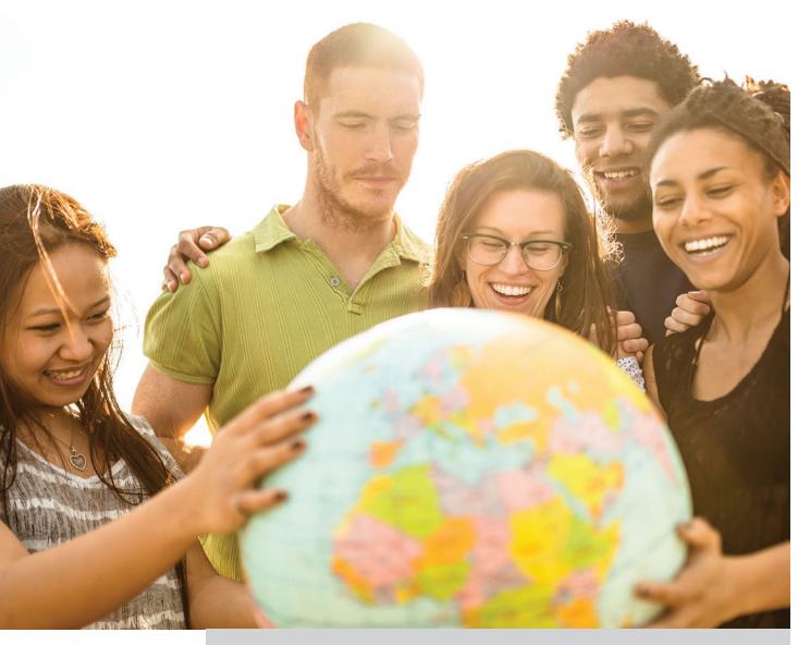
A common language is an accelerating factor in international technological collaboration. (CGTN, 2018)

The language diversity among the BRI countries can be an important roadblock. One large cluster in the area is the former Soviet countries group in which Russian was the lingua franca, and higher education was mostly in Russian. Although Russian is still spoken by most of the educated people, the number of Russian speakers is decreasing in non-Russian countries (Pavlenko 2008). China is promoting Mandarin Chinese via scholarships in China and other mechanisms. For example, Masood (2019) explains how Mandarin becomes an optional language choice in Pakistan. However, Chinese is very far from being the lingua franca of BRI. The obvious choice is English for cooperation programs for the foreseeable future. Although the existence of former British colonies in the region like India and Pakistan is facilitating this option, the proportion of English speakers as a second language is very low in most of the area, including Central Asian countries.