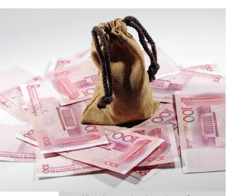
In multilateral cooperation, the parties can form a pool from which the joint projects are funded based on merit, or a "fair return" principle can be adopted. (Chinadaily, 2021)

as indicated by Guerrero Bote, Olmeda-Gómez and de Moya-Anegón (2013), the gain in impact increases with the number of countries involved. The emergence of a dominant core should also be avoided because, first of all, the main idea is to have an inclusive and balanced model. A dominant core may even lead to brain drain in the long run. Masood (2019) gives an example of how China tries to prevent brain drain into China. However, preventing brain drain should be a primary concern for the whole design of the mechanisms because losing very scarce human resources would be detrimental to the development goals of many small nations.