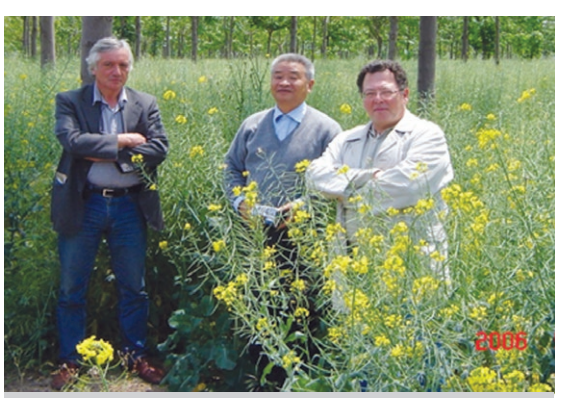
Agroforestry /Farm Forestry /Energy Farm pilot application based on Paulownia – Canola inter-cropping carried out in Bergama (May of 2006)

study carried out in the Bergama (antique Pergamum) district of Izmir Province of Turkey.