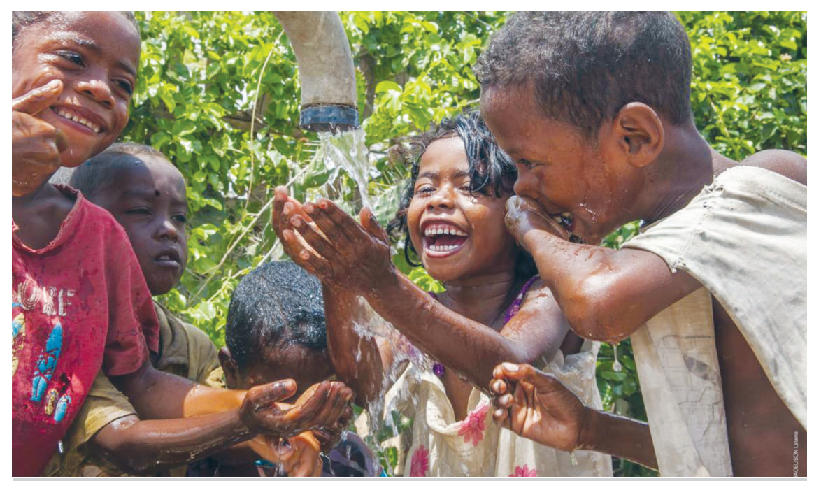
According to reports based on 2017 data and published by the World Health Organisation and UNICEF in 2019, 884 million people were completely deprived of clean drinking water resources. (UNICEF's website, 2019)

The pilot project briefly described below, not only limited to Turkey, can well be proliferated and generalised across "the Middle Corridor" as a "Green Silk Road /Green Belt" project extending from the Mediterranean to Pacific Basin.