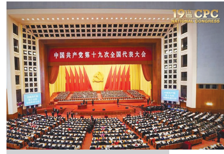
In the 19<sup>th</sup> Congress held in 2017, eco-civilization gained further priority. (CGTN, 2017)

Eco-civilization, as a generalization we accept