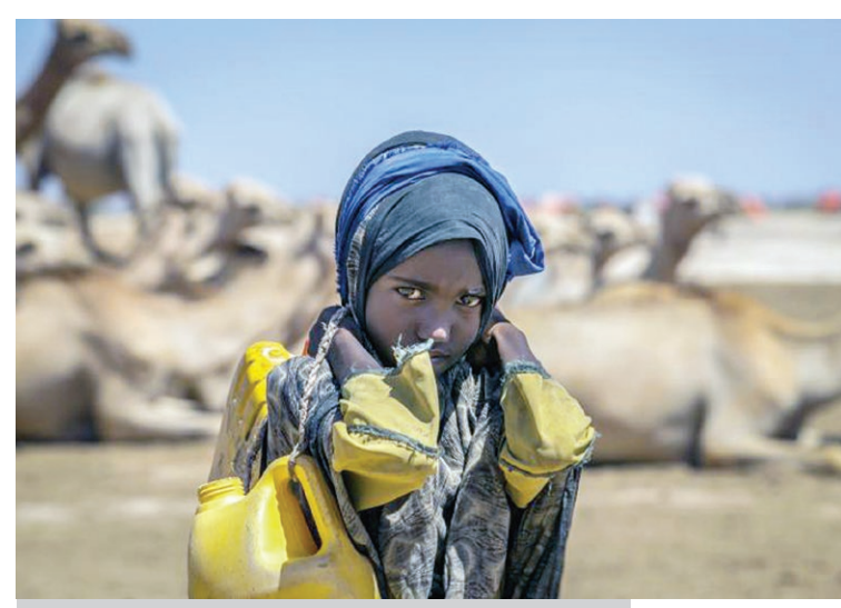
According to UNICEF, the climate crisis is a child rights crisis. (UNICEF's website)

At first glance, the intensive discussion of these issues in the international community comprising various NGOs, relevant organizations, and academic circles gives the impression that there is high collective sensitivity in combating climate change, and that the