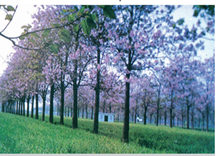
Poplar-Wheat intercropping

In the Farm Forestry/Agroforestry practices, which have been applied for hundreds of years in China, field crops and trees are grown together on the same agricultural land. In these applications, almost all kinds of field crops and suitable tree species are used. Below are images of typical agroforestry applications where economically valuable trees are intercropped with conventional field crops.