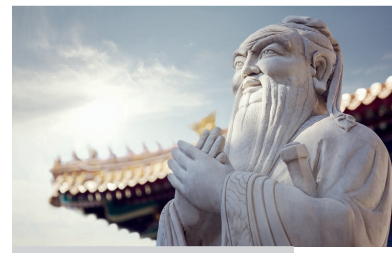
Confucius Institute carries the task of introducing the Chinese language to the world, disseminating Chinese culture, and enhancing exchanges between different cultures. (CGTN, 2018)

Second, China must actively shoulder the responsibility of being a great power. As China's international status and influence gradually increase, the international community and Middle Eastern countries hope China will play a more proactive role in the Middle East. In this regard, China must respond to these expectations by taking responsibility for peace and development. Actively taking on responsibility is an important symbol of China's practice of great power diplomacy (Xiang & Han, 2020). Democratization in the Middle East has experienced a slow course of exploration for decades after World War II. With the fierce confrontation between strengthening the authoritative regime and advancing democratic politics, the process has been interrupted from time to time, and there have repeatedly been setbacks and bumps. Relative to the pace of global political evolution, democratic politics in the Middle East are behind other developing areas (Hua, 2018). Especially after the outbreak of the Arab Spring, the conflicts in the Middle East have become more complex and changeable.