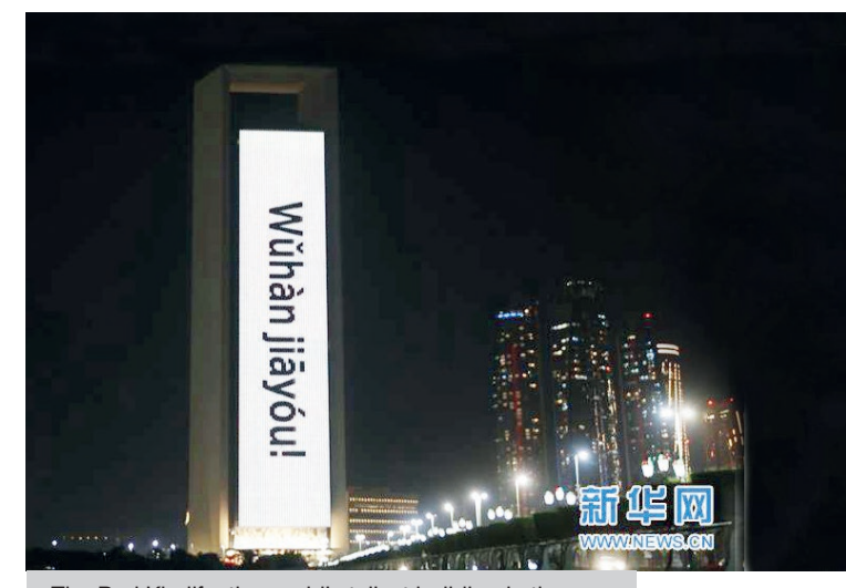
The Burj Khalifa, the world's tallest building in the UAE, displayed encouraging slogans such as "Come on, Wuhan!." (Wuhàn jiāyóu!). (Xinhua, 2020)

al Development Strategy", Qatar's "2030 National Vision", Bahrain's "2030 Economic Development Vision", Egypt's "2030 Vision Sustainable Development Strategy", Kuwait's "2035 New Kuwait", Oman's "2040 Vision", and other national mid-term or long-term development strategies. They are all committed to solving the "governance deficit" plaguing Arab countries, such as a single economic structure, lagging industrial development, and high unemployment of youth (Zhang, 2019)