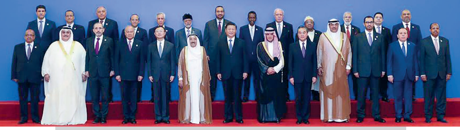
Ministerial meeting of the China-Arab States Cooperation Forum in Beijing, capital of China, July 10, 2018.

With descriptive case study methodology, this article revolves around these questions: How do China's cultural communication mechanisms work? Why does China's cultural communication play an essential role in the Middle East under the BRI? What is its characteristics? To answer these questions, the article is structured in three parts. The first part will outline the role of cultural communication in Chinese diplomacy, based on cultural communication, to jointly build the BRI. The second part will focus on Chinese communication with the Middle East through cooperation related to the pandemic, tourism, Confucius Institutes, and the China-Arab States Cooperation Forum. The third part will highlight China's cultural communication with Chinese characteristics in the Middle East.