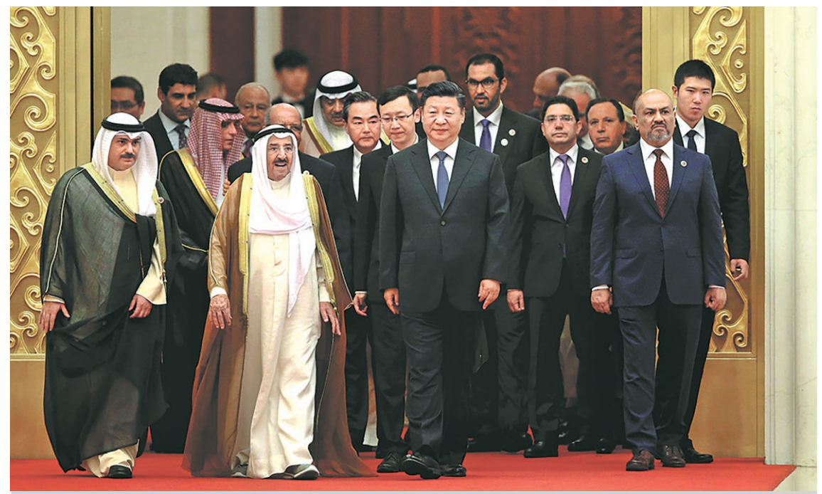
Cultural exchange between China and Arab countries primarily relies on top-level government action.

China-Arab cultural exchanges consist of educational, media, tourist, and religious interactions. The first focuses on elite and intellectual exchanges; the second aims to influence public opinions of the target countries; the third aims at better understanding between the mass; the fourth attempts to influence religious groups between Chinese and Arabs. The following are the operations and cooperation areas for cultural exchanges between China and Arab countries.