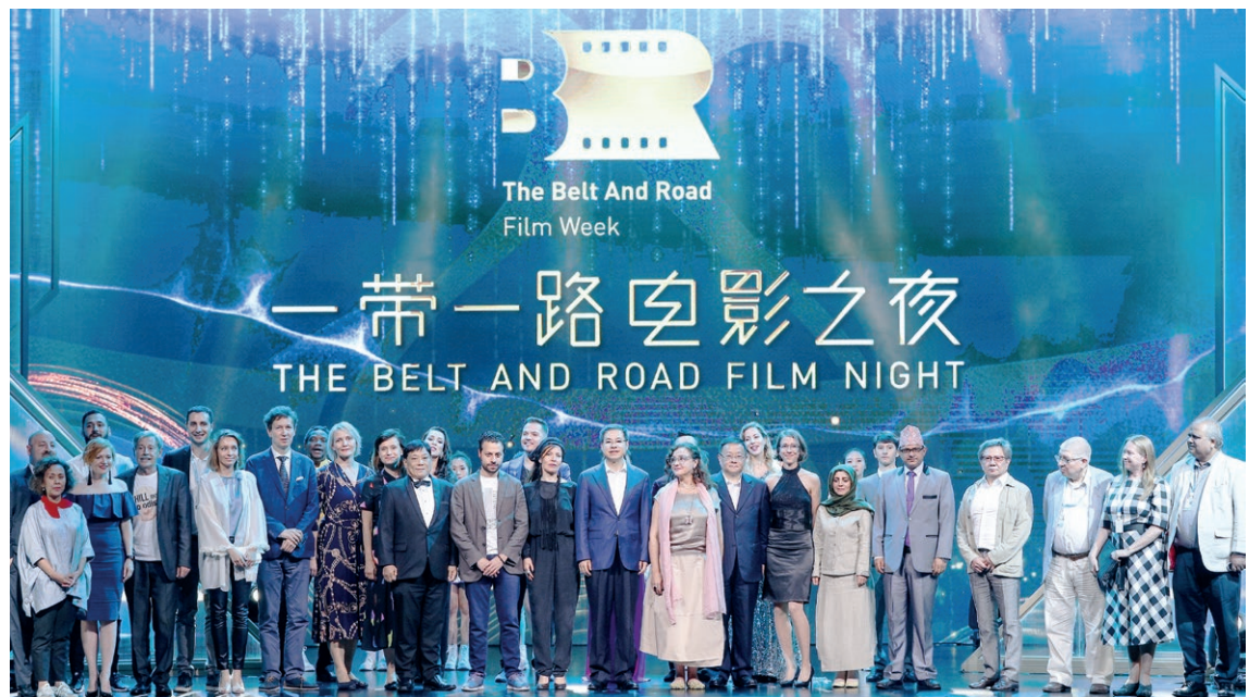
The exchange of visits between art festivals and literary and artistic groups is an important part of the CASCF on cultural exchanges and cooperation. (CGTN, 2019)