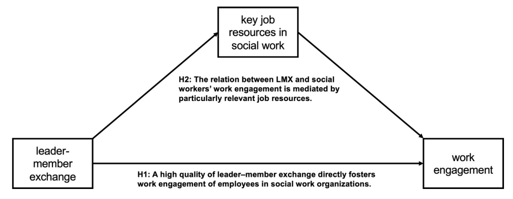
Figure 1. Conceptual framework.

B. Wagner, C. Koob Heliyon 8 (2022) e08793