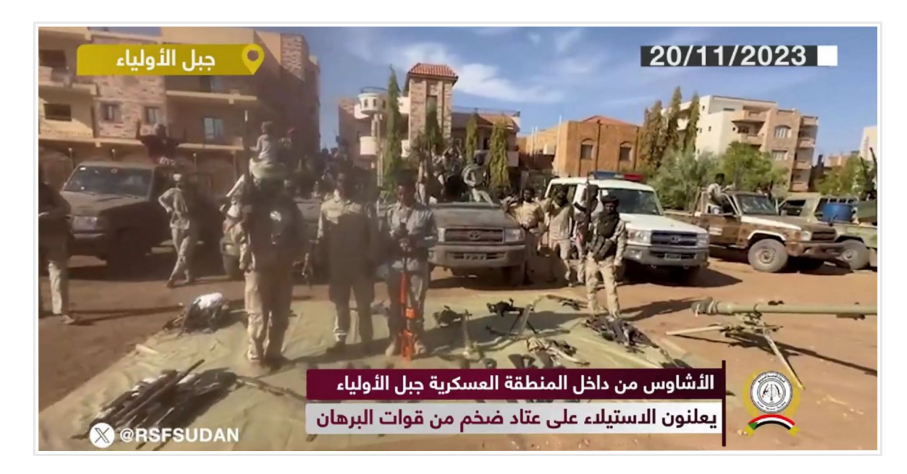
Note: This is a Screengrab from a video posted by the RSF on X. The weapon furthest to the right is likely a Soviet SPG-9 anti-tank gun. SPG-9s have reportedly been used by the SPLM-N in previous conflicts in Blue Nile and Kordofan.

Figure 1. RSF Soldiers Posing with Weapons Allegedly Looted from the SAF in Jabal Al-Awliya, November 2023