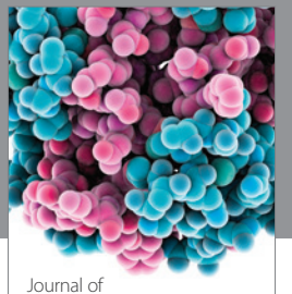
Journal of Diabetes Research