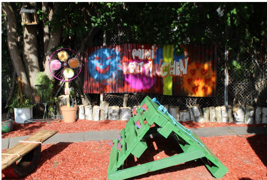
Figure 5. Playground after intervention at Beettinchen, Märkisches Viertel.

of the majority of the refugees and who acted as mediators between the students who did not speak the language. Although we relied on non-verbal tools, it was important to offer the possibility of creating dialogues in their native language and, most significantly, with others who shared a similar culture and background. We wanted to obtain information and perceptions from the residents that went beyond such techno-pragmatic issues as, for example, lack of access to housing, language skills, or income problems.