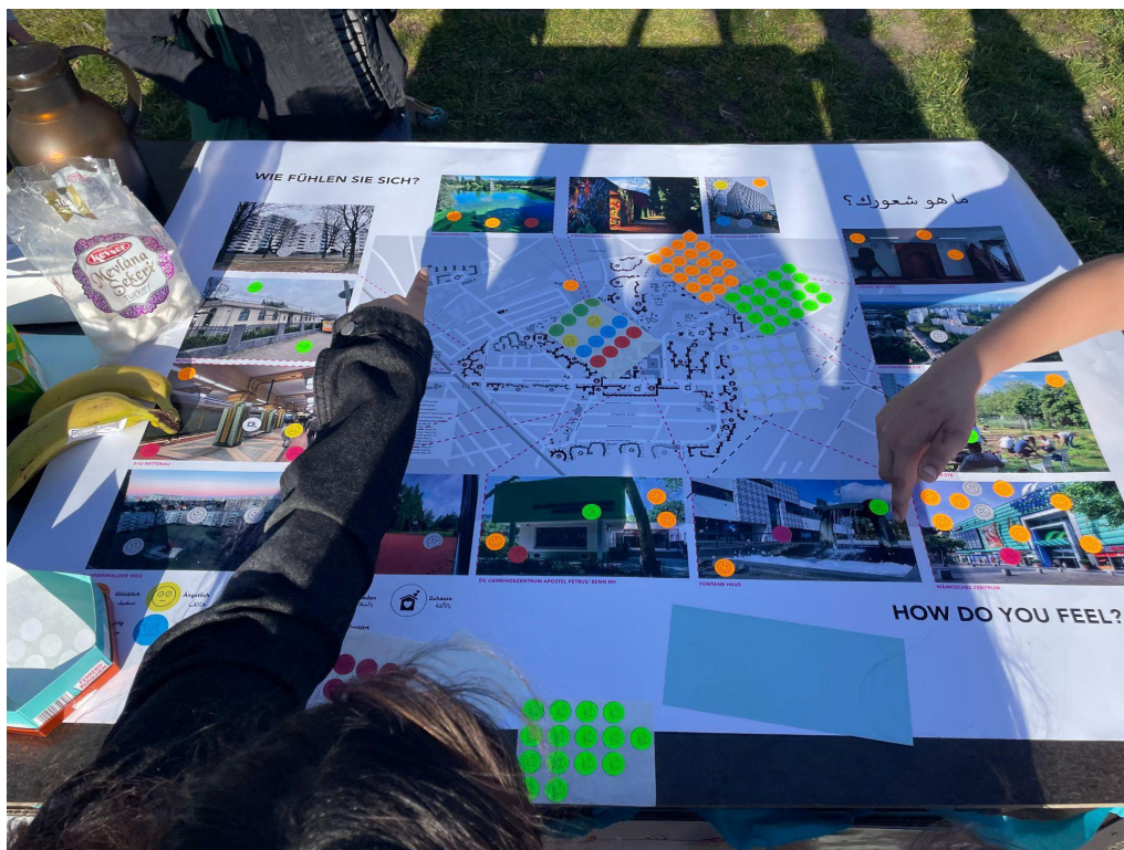
Figure 1. Map of emotions in Märkisches Viertel, Berlin.