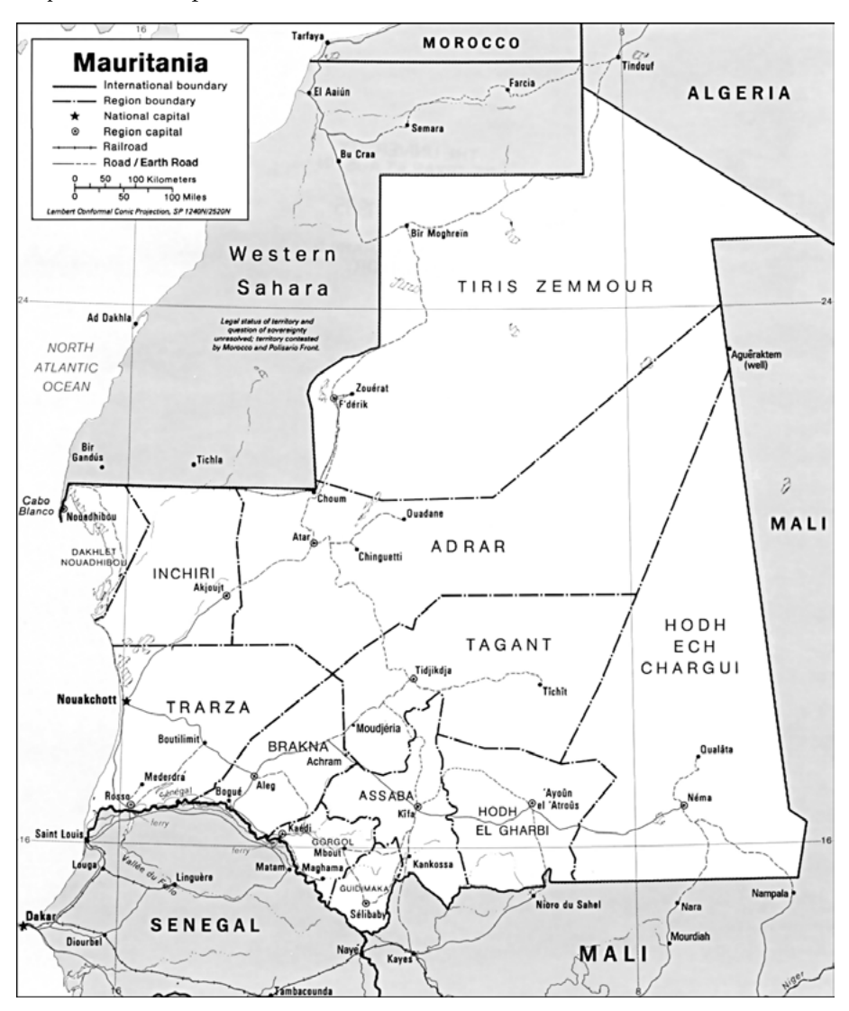
Map 1: Islamic Republic of Mauritania

Based on "Mauritania 1995"