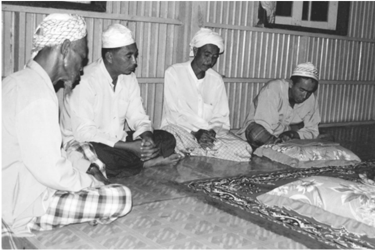
Islamic Chant, Patani, South Thailand.

Does the Songkla-based movement take the place of a third sector between market and state? The ‘club’ provides a forum for the organisation and networking of the Thai-Buddhist middle class. The cultural movement presents itself as firmly anchored in Thai culture. Interestingly, it is not the central Thai culture that has been performed in the urban events, but rather, local community culture. Local people are urged to participate in the building of baan muang in Songkla. Although the association does not challenge the legal or political system, the middle class is increasingly able to impose its moral standards on the rest of urban society. From this angle, the club succeeds in an upgrading of the cultural field. The enhancement of the cultural field is strengthening the position of the new middle class. The strategies of the people’s organizations in Songkla are processes of local reconstruction, self-awareness and emancipation.