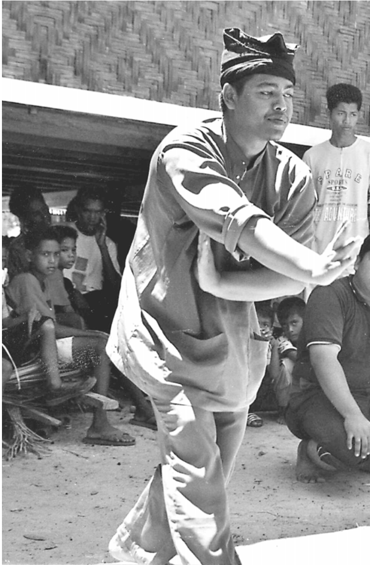
Performing the Malay Silat in Satun, South Thailand.