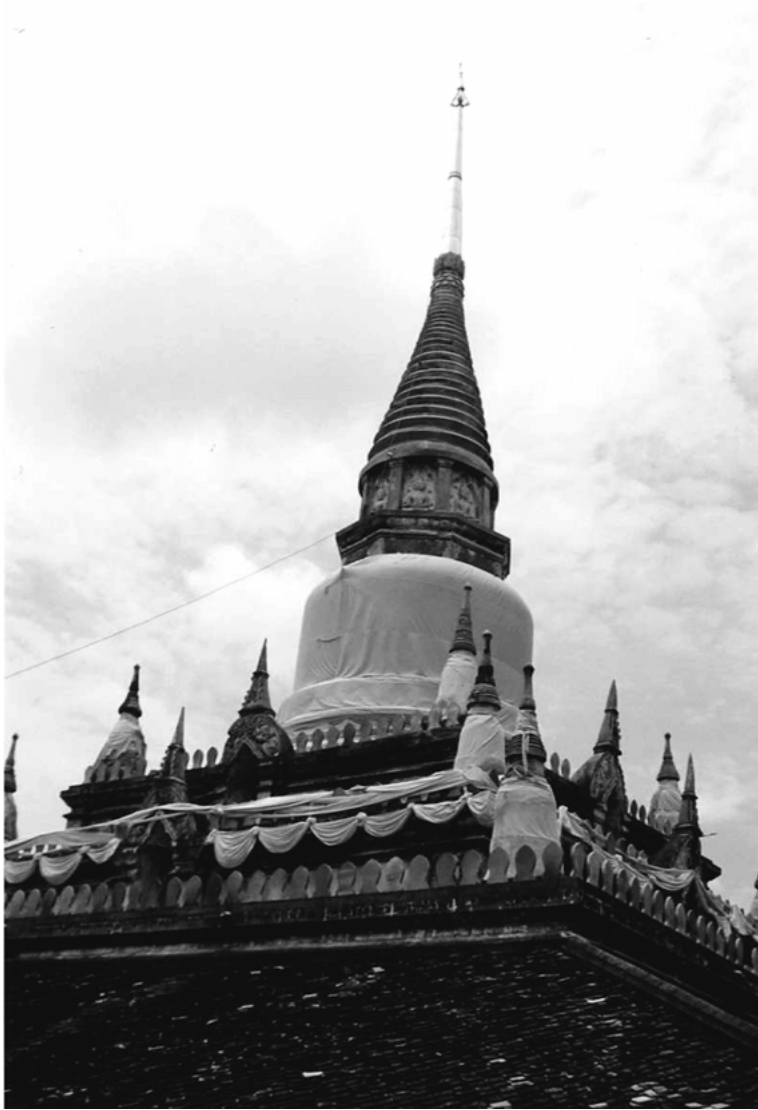
Wat Phra Kho, Reliquia, Songkla, South Thailand.