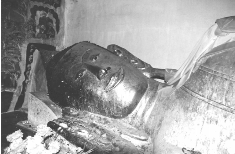
Reclining Buddha, Wat Sathing Phra, Songkla, South Thailand.

the meaning of childhood and of the meaning of parent-child relationships.