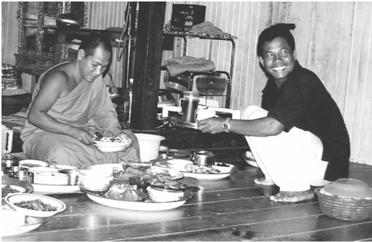
Giving Alms in Kelantan, Malaysia.