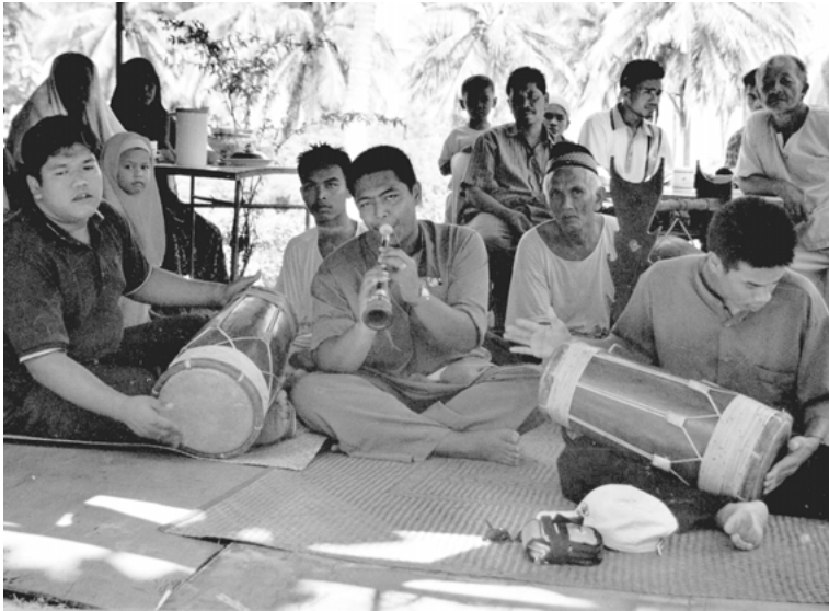
Playing for a Muslim Wedding, South Thailand.

The manifestation of Muslim identity reflects the symbiosis of the Thai government and the Chinese bourgeoisie, the concentration of the economy in the hands of Sino-Thai entrepreneurs and the marginalization of the Malay Muslim people. Second, it shows that the construction and revitalization of identity narratives are themselves a political action. Globalization facilitates the flow of religious and ethnic identity in many ways and puts the the borderland and the revitalization of identity in a new spotlight. Far from being new, religious identities are the product of century-old struggles.