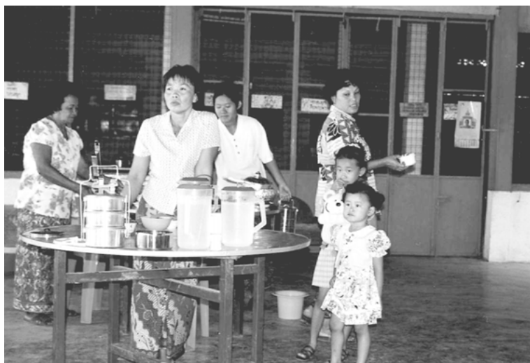
Preparing Alms, Kedah, Malaysia.