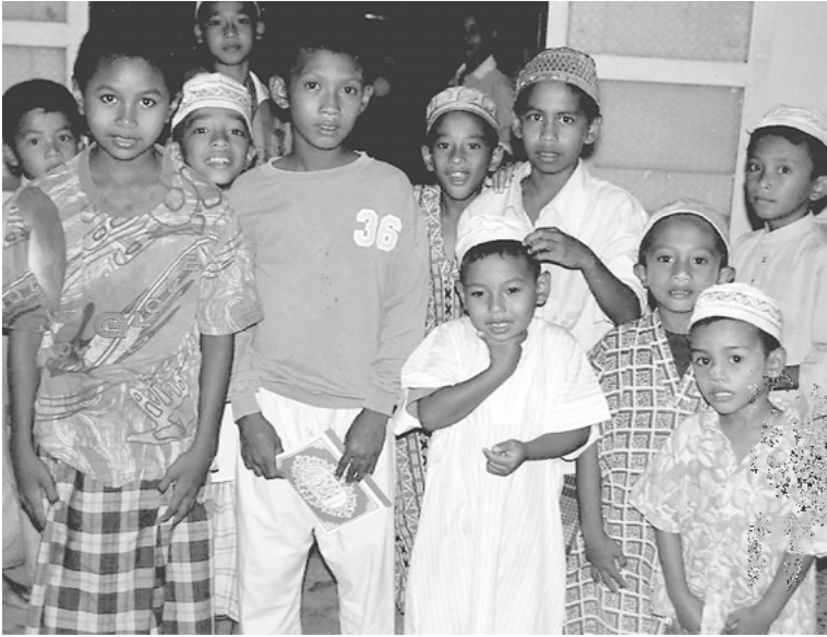
Children at Prayers in Narathiwat, South Thailand.