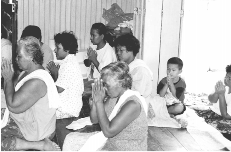
Women Merit Making ( tambun ), Kelantan, Malaysia.

include stereotypes and rhetorical attacks against the Thai Buddhist. The mediation of the public sphere by the public heroes to the global Arab Islamic public sphere is very desirable for the articulate Malay-Muslim middle class. Furthermore, solidarities to the governing PAS in Northern Malaysia and friendships between charismatic religious leaders on both sides of the Thai-Malaysian border are established.