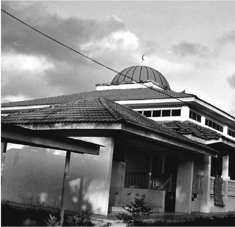
Mosque, Langkawi, Malaysia.