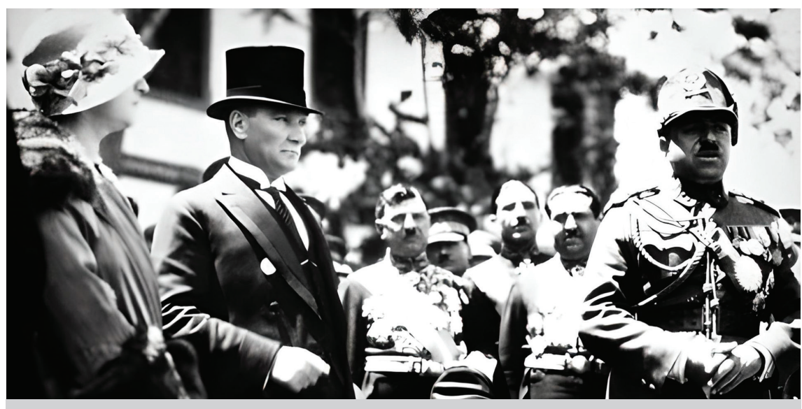
Atatürk and King Amanullah Khan of Afghanistan, 1928, Ankara (TCCB, 2023).

The aforementioned states share several salient attributes, including a robust lineage of imperial and state traditions. Their historical trajectories have borne witness to experimental endeavors that facilitated the dismantling of antiquated norms and the establishment of novel paradigms. Moreover, they possess a reservoir of capability, erudition, and cultural heritage that positions them as potential agents of transformative change.