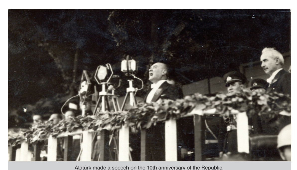
29 October 1933 (ATAM, 2023).

This can be counted as one of the characteristics of the Turkish Revolution. We know that the leader of the revolution later took a special interest in our Turkish language, devoted a lot of time and effort to it, and resisted imperialism in that field as well. It is an important building block that makes a nation a nation. The Language Revolution is one of the deep-rooted and important aspects of the Kemalist Revolution.