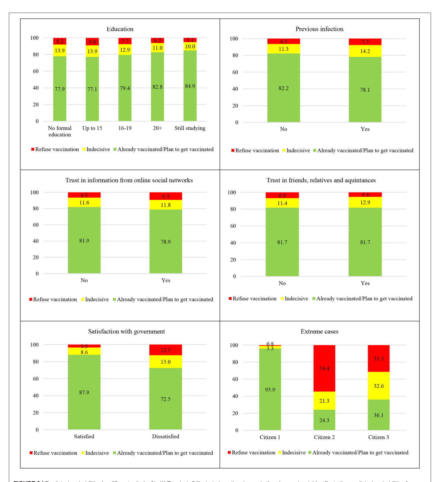
FIGURE 3 | Predicted probabilities by different criteria, %. (1) Panels 1–5 illustrate how the change in the observed variable affects the predicted probabilities for an average EU citizen. (2) Panel 6 shows the predicted probabilities in the extreme scenarios. Citizen 1—was not ill because of COVID-19, but knows people who were seriously ill; satisfied with the way government has handled the vaccination strategy (including the transparency issues); does not rely on friends, relatives, media, or online social networks when seeking information on COVID-19; does not think she/he can avoid infection without vaccination; still studying. Citizen 2—was ill because of COVID-19, but does not know people who were seriously ill; dissatisfied with the way government has handled the vaccination strategy; relies on media and online social networks when seeking information on COVID-19; thinks she/he can avoid infection without vaccination; finished education by the age of 15. Citizen 3—was ill because of COVID-19, but does not know people who were seriously ill; dissatisfied with the way government has handled the vaccination strategy; relies only on friends and relatives when seeking information on COVID-19; thinks she/he can avoid infection without vaccination; never had formal education.