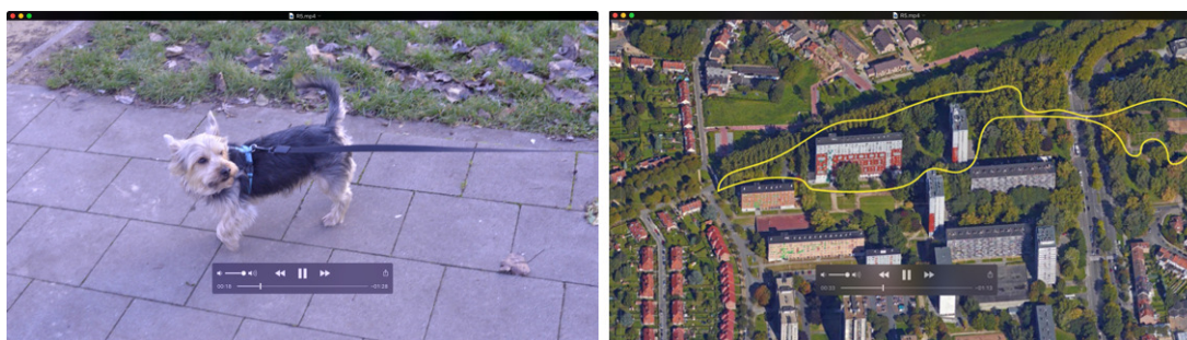
Figure 1. Stills of video fragment of resident showing her daily walks with her dogs (video P4).

Some uses remain overlooked by the planners, such as those of the shared spaces in the apartment blocks. For inhabitants, these are social spaces where neighbourly relationships play out in elevators or hallways, where people know each other by sight, greet each other, and/or chat. These spaces function as parochial