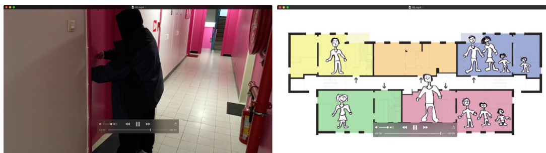
Figure 3. Stills of video fragment of an inhabitant discussing neighbourly relationships (video P4).

The regeneration plans explicitly aim to foster a sense of responsibility among residents through "mental and social appropriation processes" (in the case of the master plan; Office 1, 2014a, p. 82) and by involving them "in the use, management and maintenance of collective