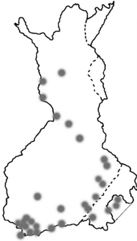
Figure 1: Map of Finland with cinematic stations

If these cinematic stations are positioned on a map (figure 1), the itinerary becomes more obvious. The route makes a quick sidestep to Tampere, one of the oldest industrial cities of Finland, giving evidence that Finland is also an industrial country, but right after that the camera returns to rural sceneries, and the cavalcade continues in the lake district, in Carelia and then moves towards the north. Finland offers a pathway through the country and is thus strongly cartographic by nature.