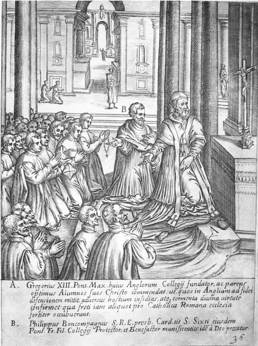
Fig. 7: Giovanni Battista Cavalieri after Niccolò Circignani: Pope Gregory XIII., engraving, 26,5 cm x 20,5 cm, Ecclesiae anglicanae trophaea , Rome 1584 (Stadtbibliothek Trier)