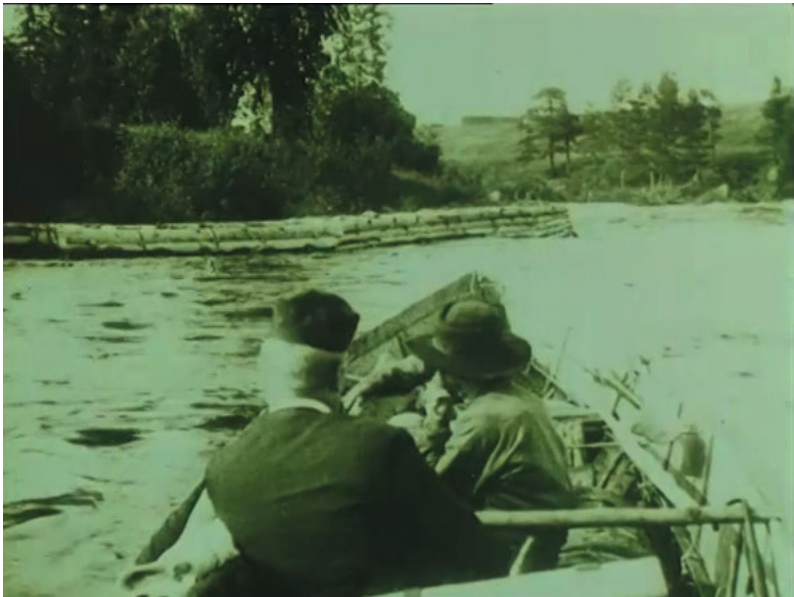
Figures 10 and 11: Immersive shots in Finland