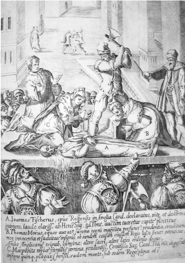
Fig. 4: Giovanni Battista Cavalieri after Niccolò Circignani: Martyrdom of John Fisher and Thomas More, engraving, 26,5 cm x 20,5 cm, Ecclesiae anglicanae trophaea , Rome 1584 (Stadtbibliothek Trier)

right. Henry is dressed in a contemporary costume, as are his soldiers, whose uniforms are equipped with the Tudor emblem.