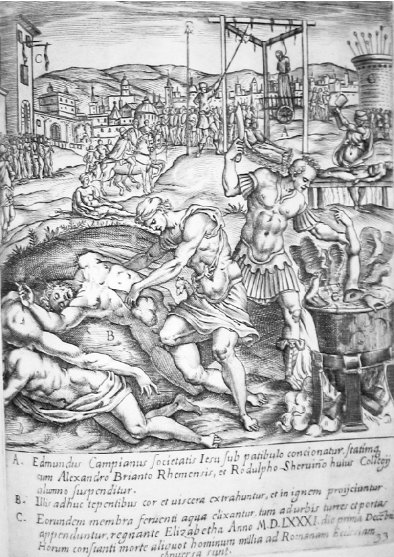
Fig. 5: Giovanni Battista Cavalieri after Niccolò Circignani: Martyrdom of Edmund Campion, Ralph Sherwin and Alexander Briant, engraving, 26,5 cm x 20,5 cm, Ecclesiae anglicanae trophaea, Rome 1584 (Stadtbibliothek Trier)