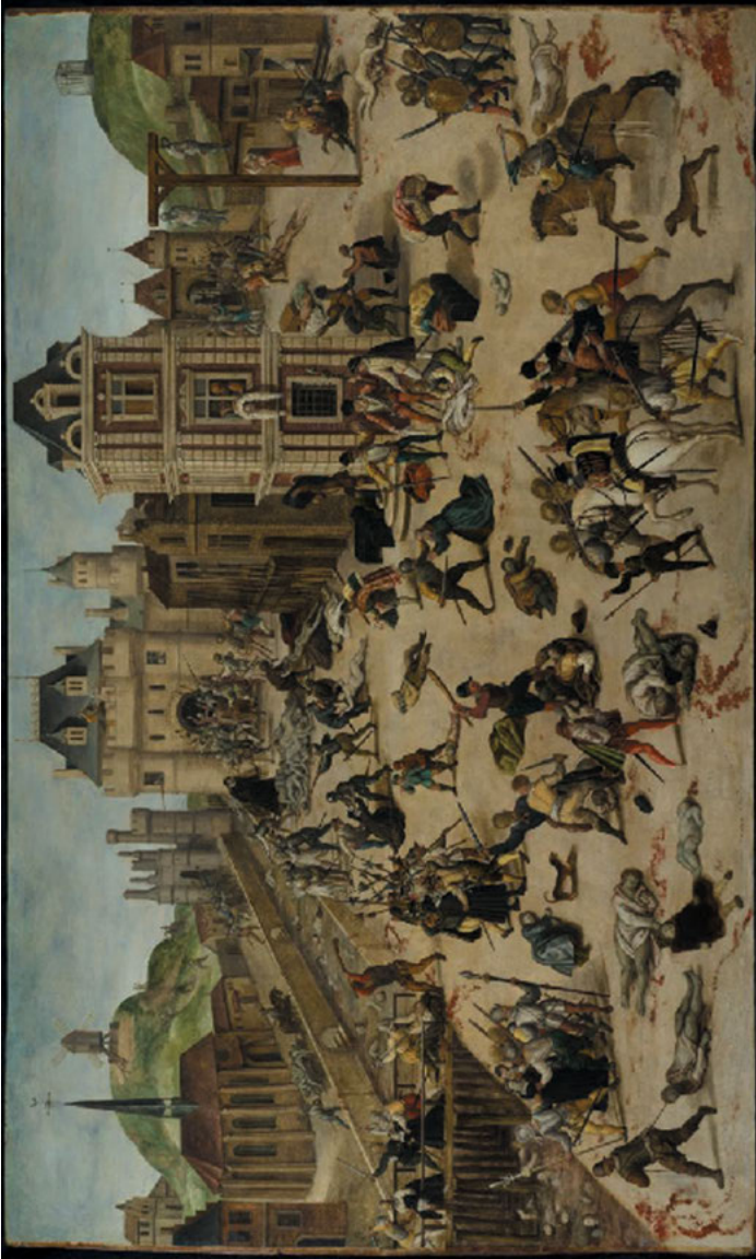
Figure 1 : Dubois, François, Le Massacre de la Saint-Barthélemy, between 1572 and 1584, oil on wood, 94 cm x 154 cm, Lausanne: Musée Cantonal des Beaux-Arts. Photo: Nora Rupp, Musée cantonal des Beaux-Arts, Lausanne; Don de la Municipalité de Lausanne, 1862