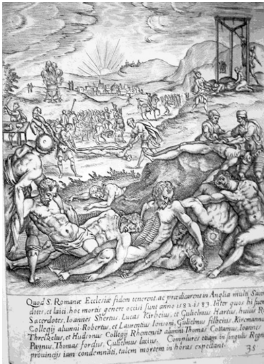
Fig. 6: Giovanni Battista Cavalieri after Niccolò Circignani: Martyrdom of Jesuit Priests, engraving, 26,5 cm x 20,5 cm, Ecclesiae anglicanae trophaea, Rome 1584 (Stadtbibliothek Trier)

The most famous Jesuit missionaries among the martyrs during the reign of Elizabeth I were Edmund Campion, Ralph Sherwin and Alexander Briant (fig.5). After their capture and torture in London Tower, they were hanged, disembowelled and quartered. Thereafter, their dismembered bodies were seethed. The persecutions of Jesuit missionaries usually ended in mass-executions by the same procedure, as is shown in the image illustrating the cruel martyrdom of thirteen students from the College, all executed between 1582 and 1583. The last, Richard Thirkeld, was killed in May 1583, shortly before the cycle was finished. Their bodies are draped in disorder and can only be identified because their names are written in the inscription beneath (fig. 6).