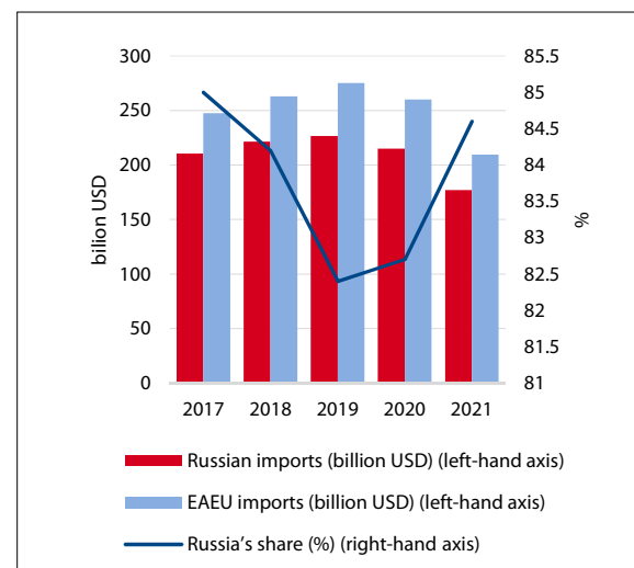
Figure 1: Russia's Share of EAEU Imports from Third Countries

Source: Statistics Department of the Eurasian Economic Union; see also Table 1 on p. 10