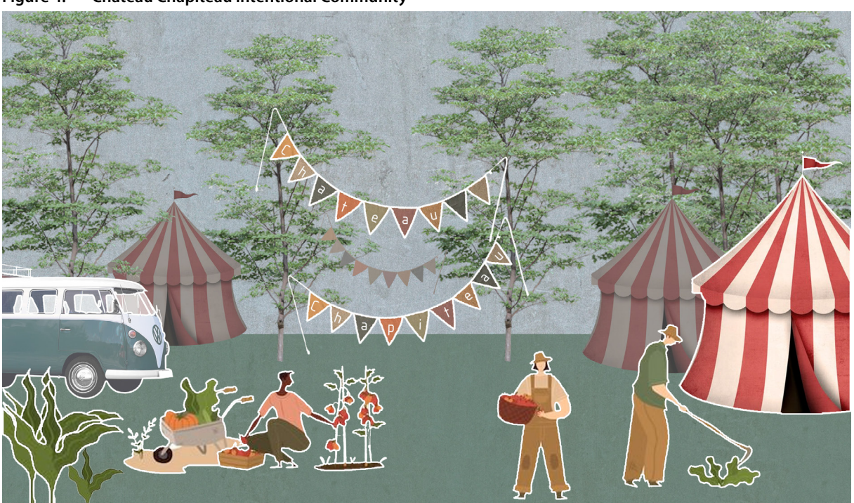
Figure 4: Château Chapiteau Intentional Community

Artist: Renata Tysiachniuk; curator: Alexandra Orlova