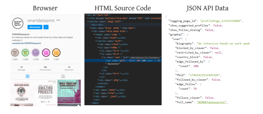
Figure 2: Three representations of the same Instagram page