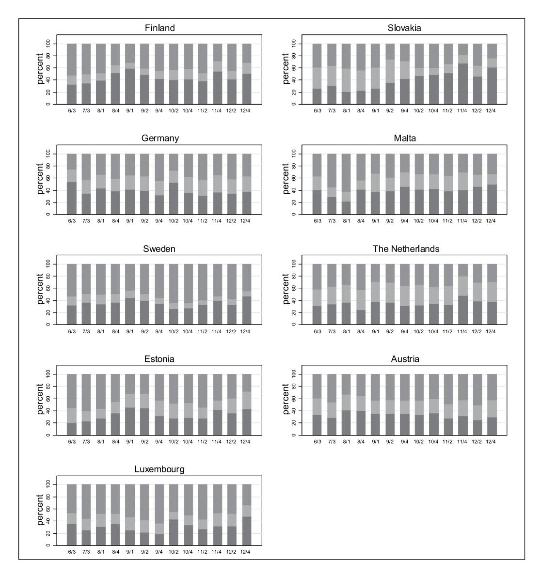
Figure 3. Within-country changes in societal pessimism 2006–2012.

(b = -0.27) and as a time-invariant characteristic (b = -0.64). These remarkable results are quite robust when it comes to the various model specifications. <sup>16</sup> As a consequence, governmental instability stimulates societal pessimism, while early elections instead provide an optimistic boost.