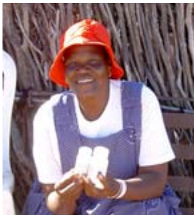
Fig. 1: Lady presenting her ARVs

It is self-evident, but it should be mentioned that people greatly appreciate the medication. Figure 1 shows a woman presenting her ARV medicines in a very open manner and one can see that she is very thankful. The next quotation about a woman from Tshane who has been living with HIV for 16 years also shows the benefit of the ARV-medication. She had severe health problems until she got ARV treatment. The people of her home village refer to her as a "living example". They mean that everybody in the village was able to observe how she recovered. Thus she is a public proof that one can get better if he or she follows the advices of the doctors.