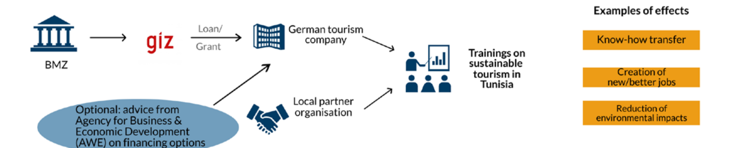
Figure 2 Illustrative example of "financing of companies"