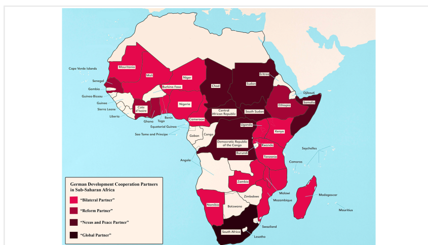
Figure 2. German Development Cooperation Partners in Sub-Saharan Africa

desisted from merging the Federal Foreign Office (FFO, now led by Annalena Baerbock from the Greens) with the development ministry (BMZ, led by Svenja Schulze, Social Democrats). The discussion about whether to fuse them regularly comes up before and after national parliamentary elections in Germany. The country now remains the only member of the OECD Development Assistance Committee with an independent development ministry (OECD 2021). Representatives from the FFO regularly complain about double structures and – despite some improvements – difficulties aligning the two ministries, irrespective of whether the two given ministers hail from the same party. Partner countries of the BMZ (see Figure 2) also do not always match Foreign Office priorities. It remains to be seen whether the new government will strengthen interdepartmental coherence.