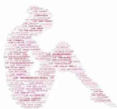
Fig. 8: Artistic visualisation of censored debate about Jiang Shanjiao.

Her original Weibo posts and related user comments are no longer accessible, as she has restricted access to her posts from before 22 April 2020 for unknown reasons. However, other users have documented the censored debate by providing screenshots of female blogger's @Why is it endless posts (Sijiubei 2020), alongside a list of rhetorical questions added by other users (Talk with you about sea and ice 2020). Furthermore, netizens found ways to circumvent algorithmic forms of social control by creating and publishing artwork with the censored words. For example, the following piece created by an unknown netizen (Fig. 8) and shared on Sijiubei's blog: