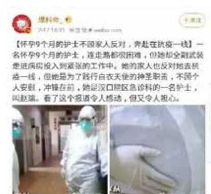
Fig. 3: Combat-ready during late pregnancy. Source: Nine-month-pregnant nurse (2020)

The media article about the miscarriage alleges the nurse wrote in her diary that “we will still be good men after weeping” (Female nurse returned 2020). Here, the feminine attribute of emotionality in Chinese traditional