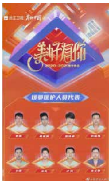
Fig. 14: Representatives of medical workers in Hubei are all male.

Despite feminist criticism throughout 2020, it is astonishing that television shows at the end of the year continued to present only male medical workers (Zhejiang TV 2021), as the following screenshot of the television show illustrates (Fig. 14):