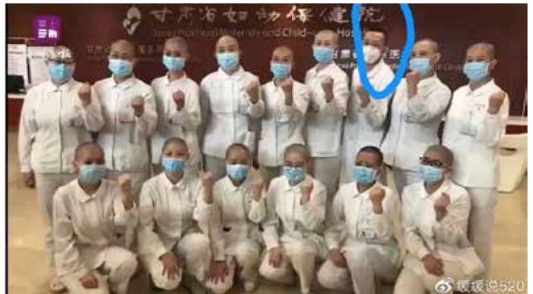
Fig. 5: An unshaved male medical professional.

wards, the news outlet Gansu Daily also published a video online showing nurses crying while being shaved (Fig. 6). These images triggered online controversy regarding gender equality.