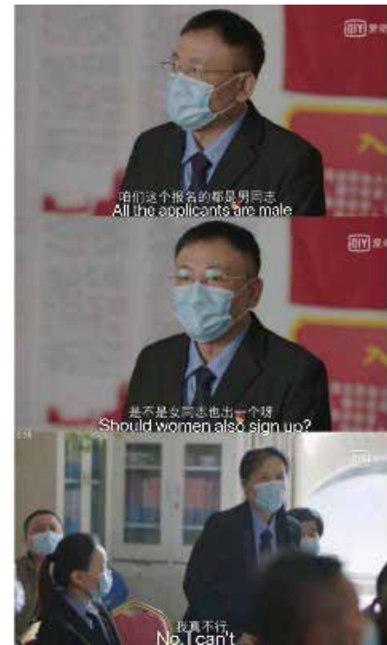
Fig. 13: Male volunteers.

and winter 2020. Critics complained about an anti-Covid-19 television series broadcasted by CCTV (Guangdong A, B, C, Ding Film Industry 2020) with the hashtag “#Stop broadcasting ‘Heroes in Harm's Way’#”, which was read by 140 million users (Wang 2020b). In one particularly controversial scene, a government official asks employees working for Wuhan Public Transport Company to join an anti-epidemic transportation team. Only men were shown standing up to volunteer, with almost all women (except a female bus driver) refusing to join the emergency team due to family obligations (Fig. 13).