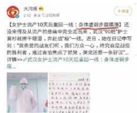
Fig. 2: Combat-ready after miscarriage.

Journalists cover nurses who rush back to the “battlefield” after miscarriage (Fig. 2) and risk the health of their unborn babies for the sake of disease containment (Fig. 3), as the following two screenshots from media reports illustrate: