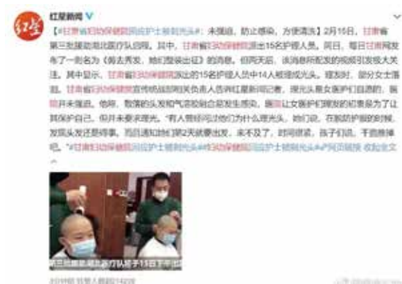
Fig. 6: Shaving nurses' heads.