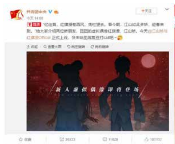
Fig. 7: Virtual idol Jiang Shanjiao and Hongqi Man.

Youth League's idol "Jiang Shanjiao", were immediately considered to be a political threat to the stability of society, and censored (Communist Youth League 2020). On 17 February 2020, the Communist Youth League released two virtual idols 5 on its official Weibo account – Jiang Shanjiao (female figure, left) and Hongqi Man (male figure, right). These idols were meant to represent the national image, but were removed after only a few hours, due to heated online debate (Fig. 7).