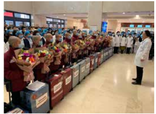
Fig. 1: Hospitals send medical teams to Wuhan.

From February onwards, female workers were included and “nurses at the frontline” became a high frequency phrase in news reports (Wumenglou-suibi 2020). Hospital social media accounts documented nurses shaving their heads to prepare for the mission (Gansu Maternal and Child Health Hospital 2020) (Fig. 1).