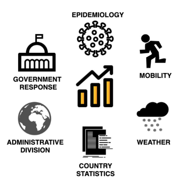
Figure 1. The main types of data categories included in the OxCOVID19 Database.

and value surveys (Fig. 1). The database uses an established spatial index GID<sup>5</sup>, which spans several administrative levels. Wherever possible, the OxCOVID19 Database draws upon official government sources, work by university-based or government research groups and data from peer-reviewed scientific papers. The data are provided with the different granular spatial level thereby facilitating a better understanding of how regional characteristics inform the spread of the disease (e.g. Fig. 2). Well-linked and granular data of this type can enable the construction of more accurate models of the pandemic by allowing reliable estimation of the required parameters for relatively small regions, avoiding the process of averaging them on a country level. They also increase our understanding of the efficacy of various interventions at the state and regional levels. Thus, we hope this resource in combination with mathematical modelling and machine learning for data analytics will enhance our understanding of the COVID-19 pandemic and facilitate the development of strategies to reduce the impact on society. Some of the key questions which the OxCOVID19 Database can help to answer include the assessment of the effectiveness of different types of non-pharmaceutical interventions such as government lockdowns, mobility restrictions, and social distancing in reducing the spread of infections<sup>6</sup>.