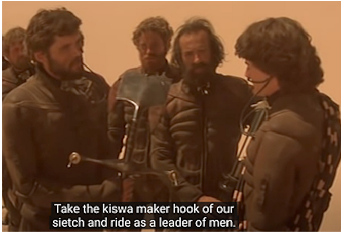
Fig. 10: Stilgar explaining how to ride the sandworm on Arrakis to Paul, Dune (1984).