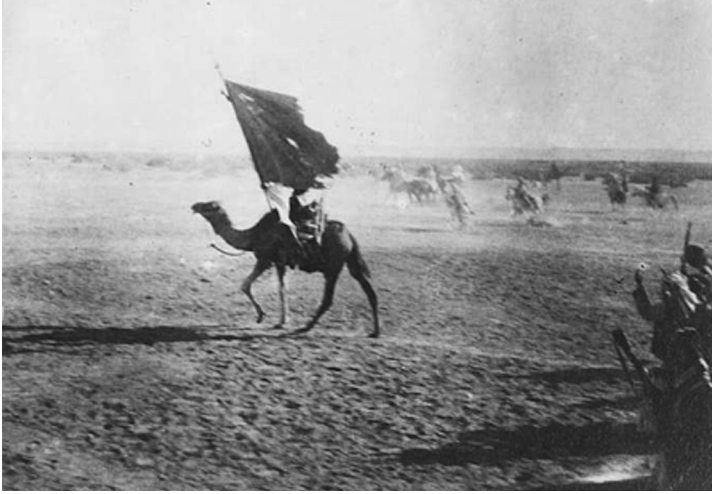
Fig. 16: The triumphal entry into Akaba, 6 July 1917, T.E. Lawrence Collection, Imperial War Museum, Q 59193.

for this military success. 305 (Fig. 16) The same day, Lawrence and eight men left the city and arrived in El Shatt in Egypt three days later to give an immediate report about the events, although he was »somewhat exhausted by 1,300 miles on a camel in the last 30 days.« 306 The news about Lawrence's victory spread fast, and his achievement was considered a »very remarkable performance, calling for a display of courage, resource, and endurance which is conspicuous even in these days when gallant deeds are of daily occurrence.« 307