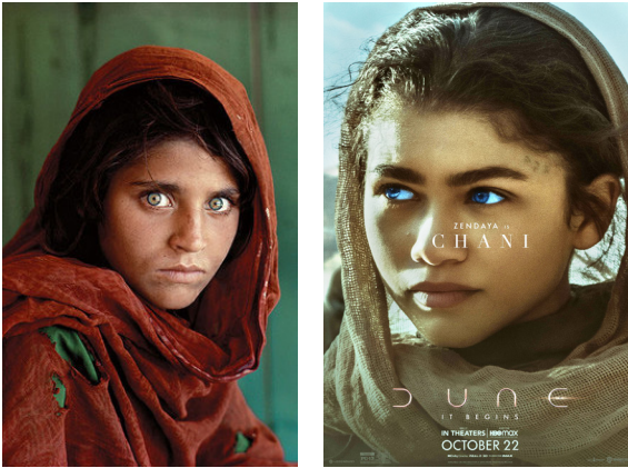
Figs. 1 and 2: The »Afghan Girl« and Chani

fact that makes Dune sound and look very orientalist in its perception and depiction of Middle Eastern culture. Therefore, this study presents a discussion of these specific aspects of orientalism and the semiotics related to them in the novels and films, showing how deeply the semiotic and stereotypical motifs related to Islam and the history of the Middle East affected and still affect the creation of popular media. After an initial analysis of the first novel's plot and a survey of the main motifs that can be identified, I will therefore show how orientalism is semiotically constructed and preserved within Dune in multiple ways. Eventually, I will take a closer look at the depiction of Paul Atreides, the novel's heroic main character, in relation to the (hi)story of T.E. Lawrence, better known as Lawrence of Arabia, an orientalist role model for the former, and the role of a holy war, the Jihad , whether it be considered as part of the First World War in the Middle East or Herbert's story in outer space. The study is consequently as interested in the historicity and the semiotic charging of mid-20th-century science fiction as much as it is in learning more about the impact of such popular media on perceptions of orientalist semiotics until today.