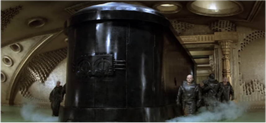
Fig. 3: The arrival of the third-stage Guild Navigator at the Imperial Palace in Dune (1984).

It becomes obvious that the spice production alone is of concern for the Space Guild, as the navigators are not only able to travel through space under its influence but are also addicted to it. Since they control interstellar travel, they are the only ones who can decide on war and peace between the Houses and are usually paid by all parties involved. Without spice, there is no future for them, which is why an ecological change on Arrakis would mean the end of the worms and thereby the end of spice, as the latter is a byproduct of worm-related procreation. 65