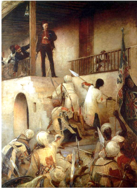
Fig. 6: General Gordon's Last Stand . Painting by George W. Joy (1844–1925); https://commons.wikimedia.org/wiki/File:General_Gordon%27s_Last_Stand.jpg (Accessed January 22, 2022).

The orientalist semiotics of Dune eventually all point towards another jihad, a holy war in the name of the Atreides, led by Paul Muad'Dib, the Lisan al-Gaib of the Fremen, who not only won power on Arrakis but intends to expand this power across the whole known universe. This part of the plot, in a way, could be understood as a resemblance of a spread of Islam across the MENA region, but one wonders if Herbert really wanted to emphasize violent expansion as the most important aspect of this jihad. In fact, the jihad rather finally links all kinds of strings of the novel to one climax, when Paul's acceptance of