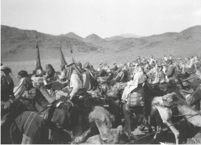
Fig. 17: Ageyl bodyguard, n.d., T.E. Lawrence Collection, Imperial War Museum, Q 58858B.

stroyed by an atomic attack and opens the way for the worms to transport the Fremen on their backs to the battle zone, while they also are part of some kind of hammer and anvil tactic that could be compared with Alexander the Great's (356–323 BCE) cavalry attacks against the Persian armies. 308 The sandworms »handily plow through the Emperor's forces in their surprise appearance,« 309 almost like a massive wall of camels when they hit the enemy lines during a full-speed advance. 310