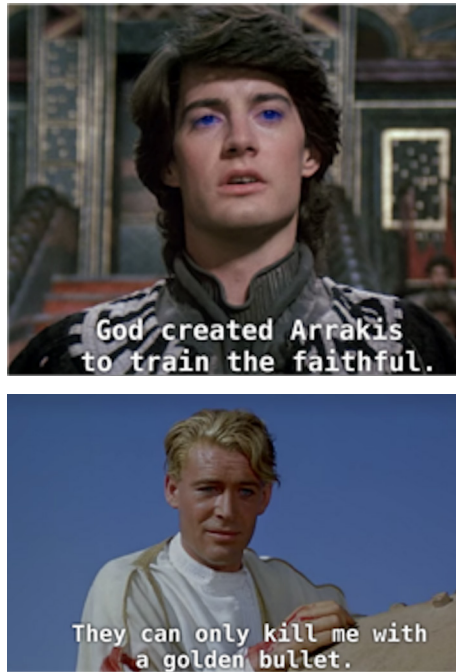
Figs. 18 and 19: Paul and Lawrence in their hubris, as depicted in Dune (1984) and Lawrence of Arabia (1962).

In contrast to these indigenous leaders, Paul and Lawrence—at least the one in the film—develop some kind of hubris as well, as they consider themselves to be superior beings, ones that are in control of everything and are thereby unable to fail (Figs. 18 and 19).