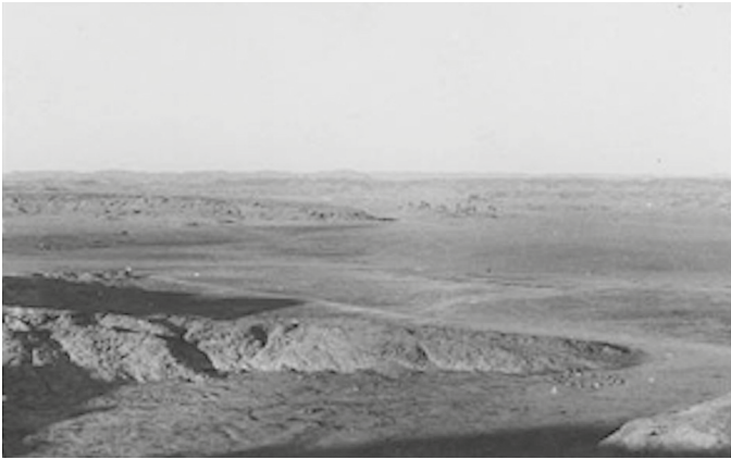
Fig. 8: View of the desert near Wejh; T.E. Lawrence Collection, Imperial War Museum, Q 59014.