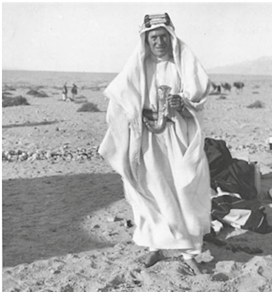
Fig. 9: T.E. Lawrence, n.d.; T.E. Lawrence Collection, Imperial War Museum, Q 59314.