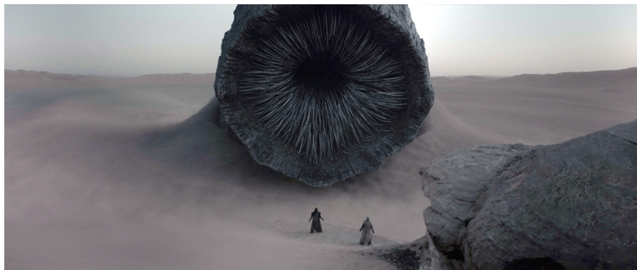
Fig. 12: Sandworm, Dune (2021)