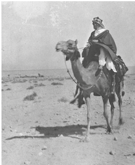
Fig. 11: Lawrence on a Camel, Akaba, n.d.; T.E. Lawrence Collection, Imperial War Museum, Q 60212.