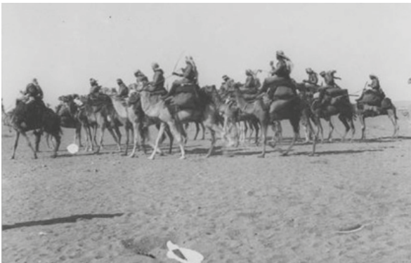
Fig. 13–15: Images of Camels related to Lawrence's operations, 1916–1918; T.E. Lawrence Collection, Imperial War Museum, Q 59073, Q 58861 and Q 59018.