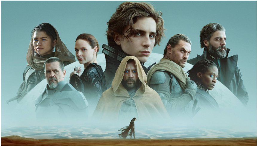
Fig. 20: The Cast of Dune: Part One (2021)

been and still are today. When one takes a closer look at the visual semiotics of the Dune films, it can be stated that David Lynch seemed to be interested in creating something truly futuristic in the way he depicted the Fremens, while Denis Villeneuve unfortunately continues the historical visualization of the story with a much stronger oriental-ization of the Fremens, who clearly can be identified as Bedouin-like Middle Easterners in the newest film (Fig. 20).