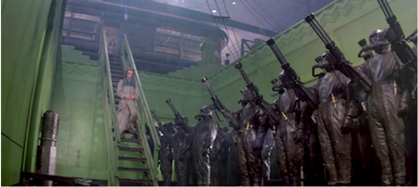
Fig. 4: Mentat Piter De Vries on his way to deliver a message from Duke Leto to Baron Harkonnen ( Dune , 1984).

Chani, who fears that her lover might die: »I'm dead to everyone unless I try to become what I may be.« Eventually, Paul becomes enlightened, and as Kwisatz Haderach, the one the Bene Gesserit wanted to create, he is able to bring down the whole universe. Using the Fremen and the sandworms of Arrakis, he forces the Emperor to accept his rule, especially since the Space Guild demands a continuation of the spice production. The inscribed »white savior« narrative, which has been used by other writers both before and after, 71 eventually brings Paul back to his original context, i. e. a leading position within the known universe. The myth is fulfilled, although it is demolished again in the following novels, which, however, are not necessarily important for further discussion here.