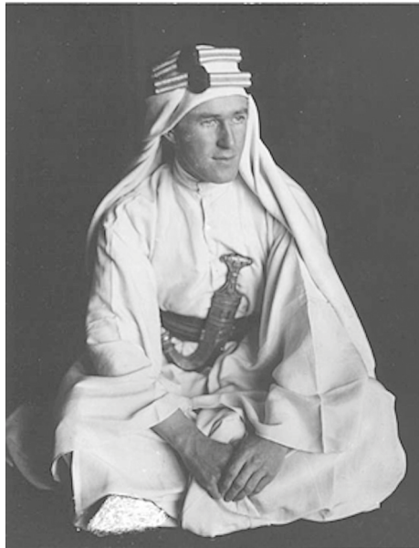
Fig. 7: T.E. Lawrence

In Dune , the time also seems to be ripe for a revolution against Harkonnen rule, and just as Lawrence seems to be an important aspect of the Arab success, Paul's appearance is a trigger for the successful guerilla war of the Fremen against the Harkonnens. 259 The orientalist semiotics are in this regard therefore also greatly highlighted by the environment, i. e. a desert, where the events take place. 260 However, while the British officer coordinates the military actions of the indigenous people and in a way solely uses their potential in the name and