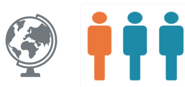
At the end of 2020, Syrians and Afghans together comprised 1 in 3 of the world's 24.6 million refugees.

Pakistan (population 220.9 million) is host to the third-largest registered refugee population in the world—1.4 million Afghans (World Bank, n.d.; UNHCR, 2021a). The majority (68%) live in urban areas, while 32 per cent live in UNHCR-supported refugee villages (RVs) (UNHCR, 2021c). Counting the 1.4 million registered refugees as well as undocumented migrants who applied for Afghan citizen cards with Pakistani authorities in 2017/18 (879,000) and mid-range estimates of the undocumented population (one million) brings the total number of Afghans in Pakistan to over three million—before taking into account recent arrivals. Pakistan has been hosting Afghan refugees for more than four decades, meaning that it is now home to a first, second and third generation of Afghans. Over the years, there has been a shift from a sense of welcome to one of burden, meaning that the present situation is often characterised by co-existence in tension (Mielke et al., 2021).