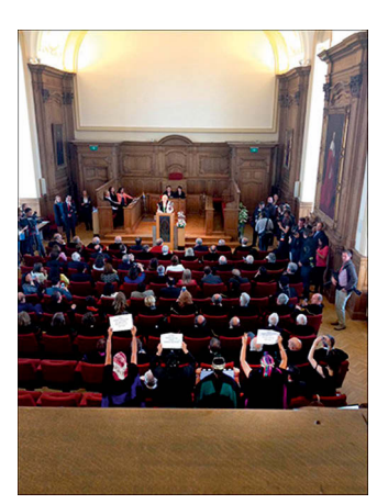
Figure 5. Funa in Leuven

Mapuche NL 2015a. "Leuven: Protesta Durante Visita de Bachelet a Bélgica." 2015. https://mapuchenl.w ordpress.com/2015/06/07/protestadurante-visita-de-bachelet-a-belgic a/.