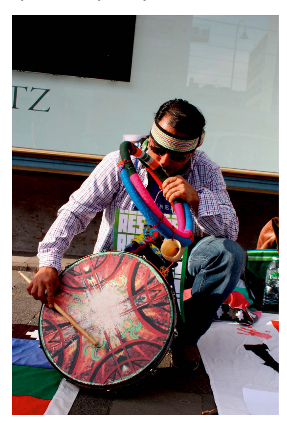
Figure 4. Solemn vigil in Cologne in 2016

human rights violations in Chile, call out the politicians responsible, and demand freedom for the imprisoned Mapuche. During such vigils, petitions by the imprisoned Mapuche and their solidarity network are read in Spanish, the local language, and Mapuzugun. These vigils have a disruptive element by disturbing the work of the Chilean consulate, getting the attention of bystanders, and interrupting the flow of pedestrians on the sidewalk.