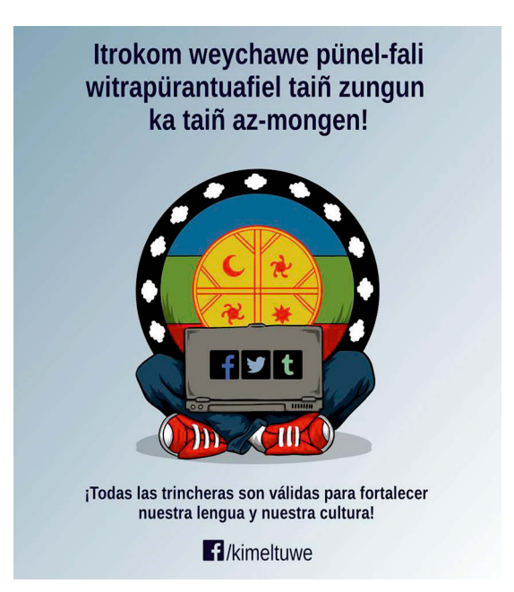
Figure 3. Kimeltuwe. 2016. "Küme antü rulpayaymün, kom pu che!"

Facebook, January 25, 2016. https://www.facebook.com/kimel tuwe. Screenshot by the author, taken January 25, 2016.