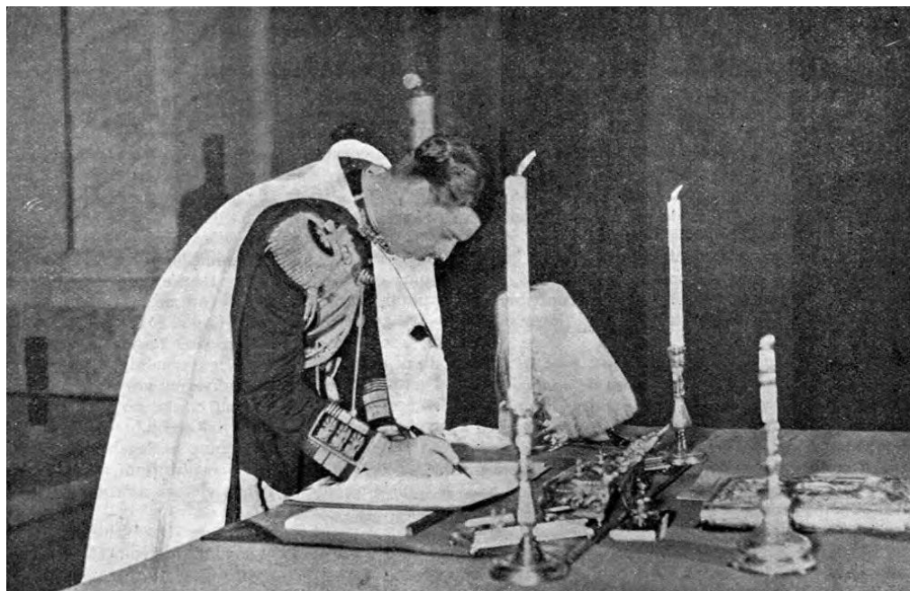
King Carol II signing the Constitution on February 27, 1938

Resting on the distinction between the «statist» version of the phenomenon – paradigmatically traced back to the Romanian theorist specifically and to the inter-war fascist politics and ideology generally, but also shown as later rejuvenated in various authoritarian guises in national frameworks of the context of peripheral development – and the «societal» one – discovered as adumbrated most characteristically in the 1920's by J. M. Keynes 8 , in order to get embodied in the structures enabling an effective negotiation between capital, labor and the state obtained in postwar developed societies –, the revolutionary piece was certainly most concerned with the realities of the second sort, rapidly consecrated in its footsteps as constituting a brand of corporatist politics compatible with the basic