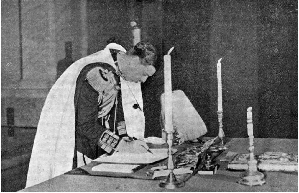
King Carol II signing the Constitution on February 27, 1938

Resting on the distinction between the «statist» version of the phenomenon – paradigmatically traced back to the Romanian theorist specifically and to the interwar fascist politics and ideology generally, but also shown as later rejuvenated in various authoritarian guises in national frameworks of the context of peripheral development – and the «societal» one – discovered as adumbrated most characteristically in the 1920's by J. M. Keynes 8 , in order to get embodied in the structures enabling an effective negotiation between capital, labor and the state obtained in postwar developed societies –, the revolutionary piece was certainly most concerned with the realities of the second sort, rapidly consecrated in its footsteps as constituting a brand of corporatist politics compatible with the basic