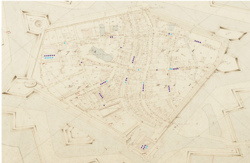
Figure 3 Map of 1866 Woerden with Hotspots of Cholera: Deaths and Recoveries