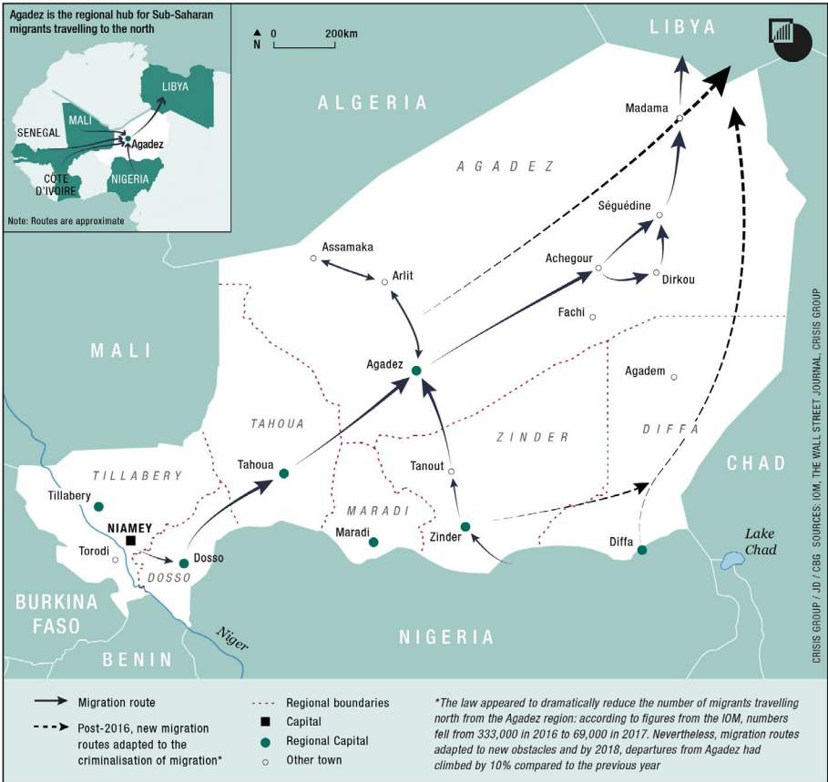
Figure 1 Migration Routes from Niger to Libya and Algeria

Many international migrants from sub-Saharan Africa who want to migrate to Libya must travel through Niger, which has turned Niger into an origin, host, and transit country. Because of its geographical position on the route between sub-Saharan and North African countries, Niger became a major transit route for international migrants – particularly in the 1990s, following the closure of the border between Chad and Libya and growing insecurity on the route through Mali (Molenaar et al. 2017; Issaka Maga 2019). To reach destinations in North Africa, both Nigerien and international migrants pass through the northern region of Agadez and its main city, Agadez. From Agadez, there are two major migration routes towards the north: via Dirkou and Ségédine towards the Libyan border, and via Arlit towards Algeria. The fact that every migrant must make a stopover in Agadez to travel further north has led to the emergence of new local economic opportunities linked to migration, particularly in the transportation and accommodation sectors. As a result, migration created economic opportunities in a region where alternatives are scarce and became an integral part of daily life (Molenaar 2017; Brachet 2012; Müller 2018).