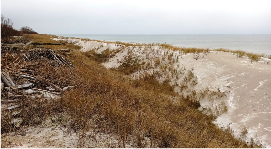
Fig. 2. Shallow deflation basin.

Trail planning. At the next stage, the trail is planned taking into account the location of the target objects, as well as environmental requirements. If it is possible to use different modes of transportation, the trails for each of them are specified.