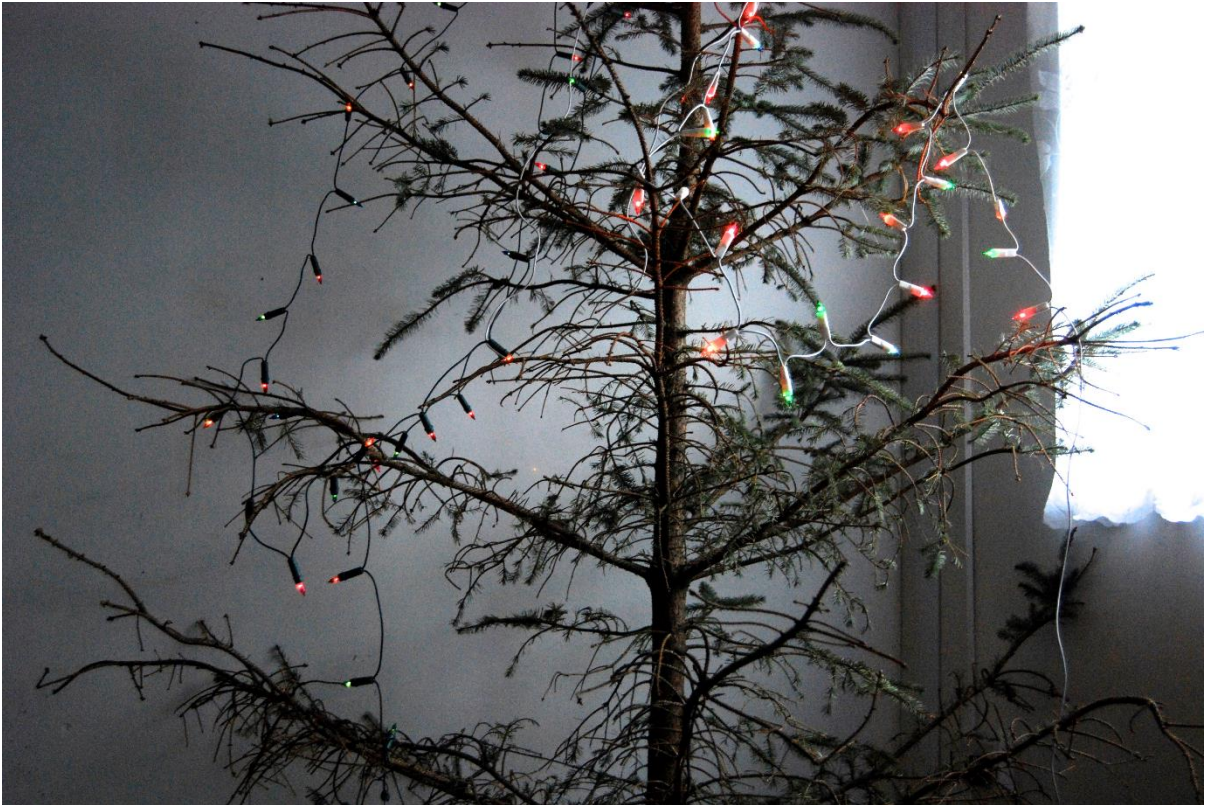
The Old Convent Direct Provision Centre, Ballyhaunis