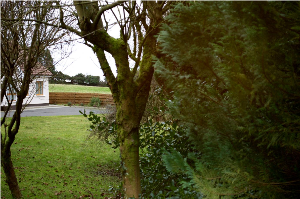
Beechlawn Direct Provision Centre, Wicklow