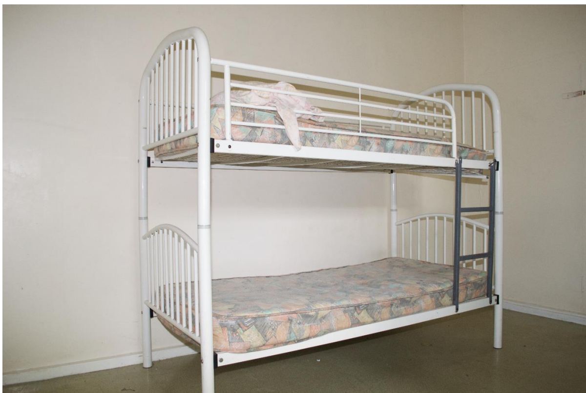
Kilmacud House Direct Provision Centre, Dublin