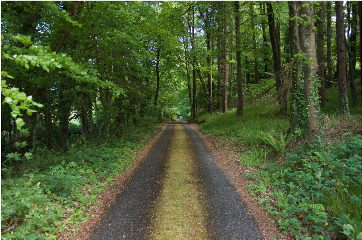
Mount Trenchard Direct Provision Centre, Foynes