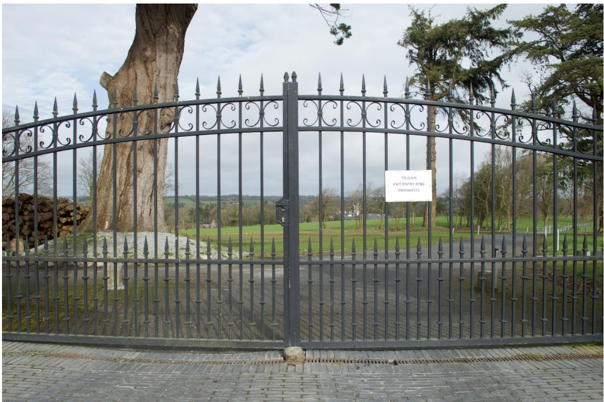
Drishane Castle Direct Provision Centre, Cork