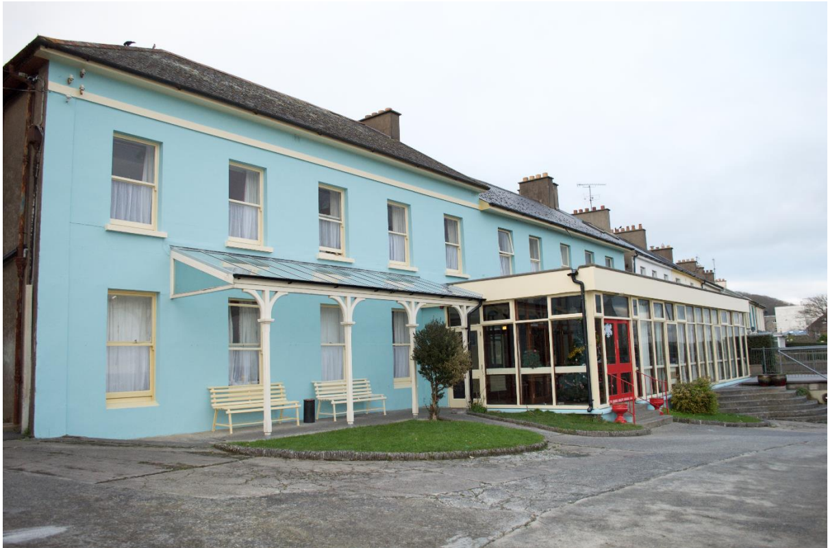
Atlantic View Direct Provision Centre, Tramore