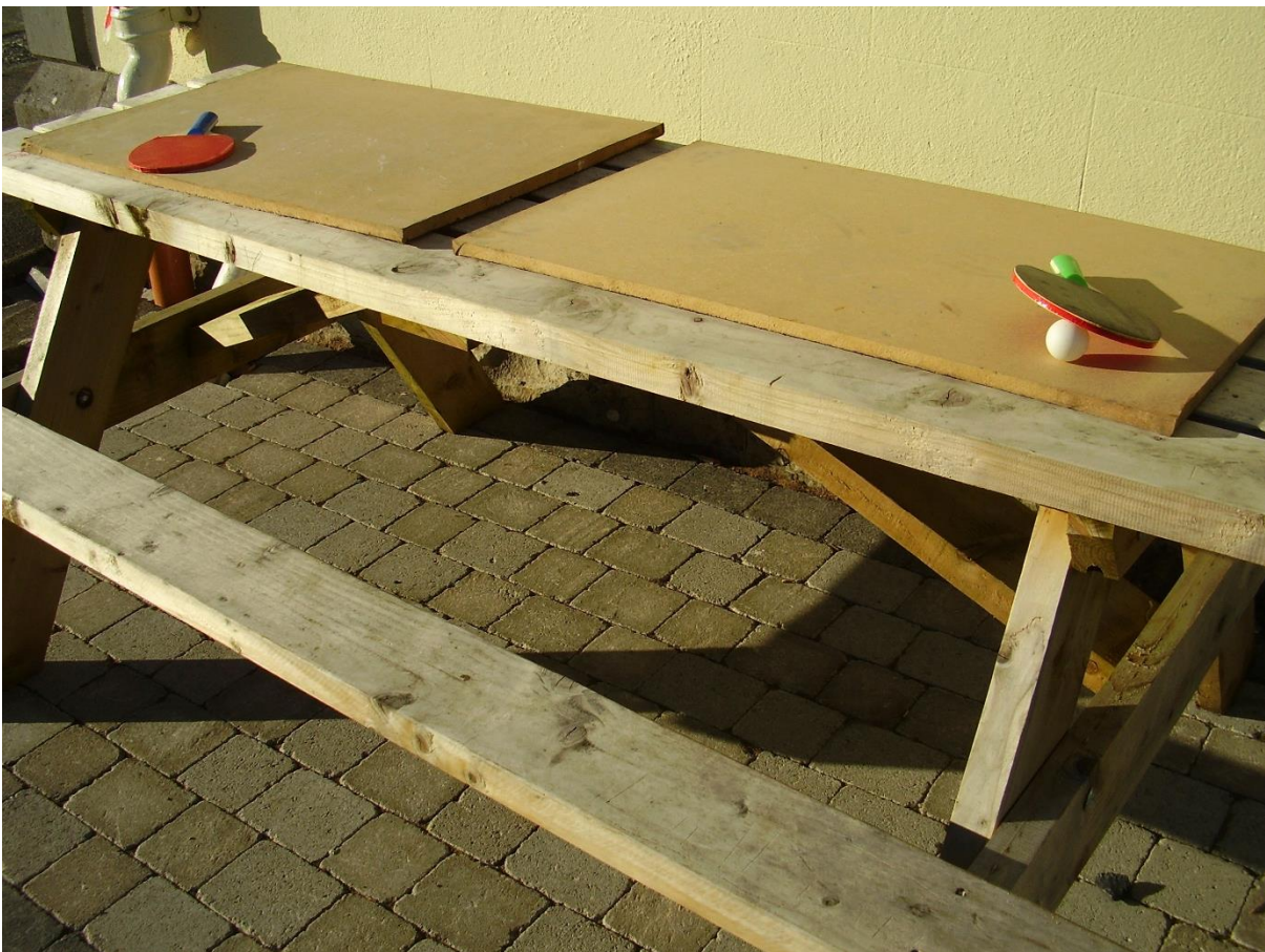
The Old Convent Direct Provision Centre, Ballyhaunis