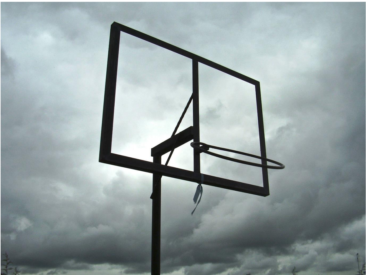
The Old Convent Direct Provision Centre, Ballyhaunis