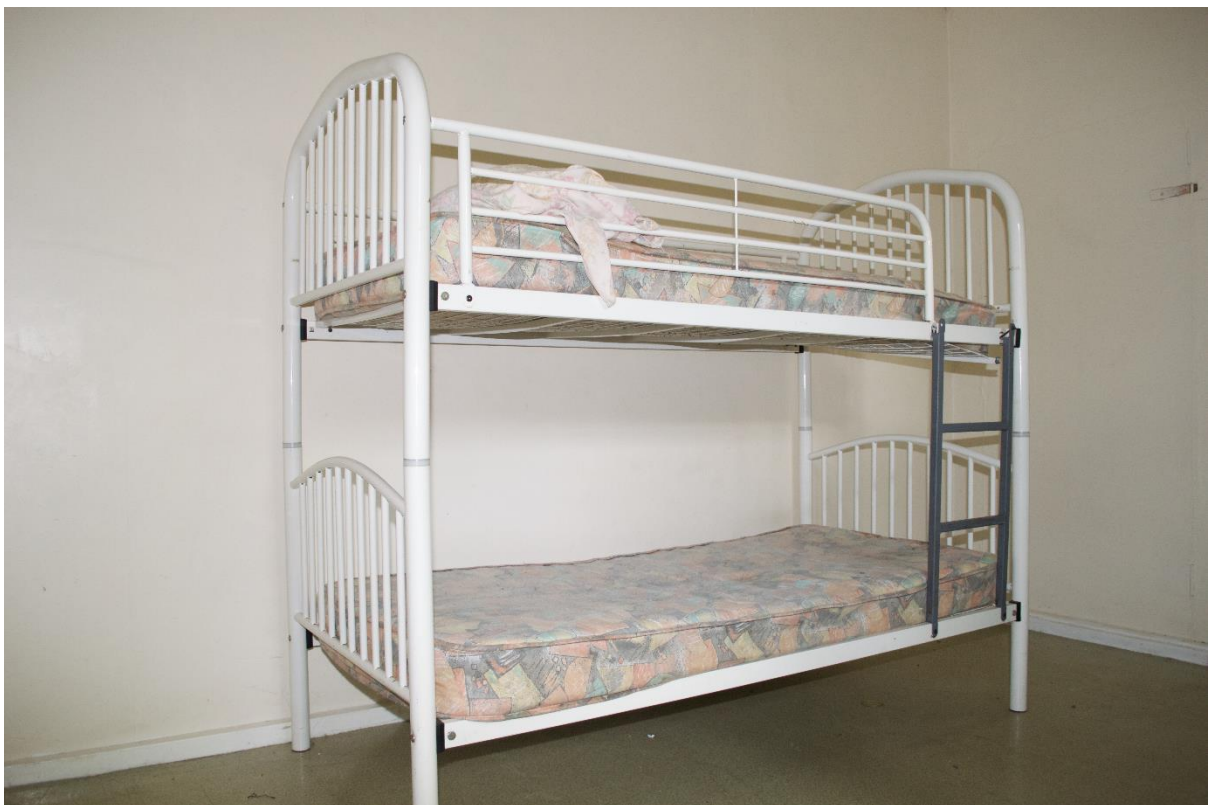
Kilmacud House Direct Provision Centre, Dublin