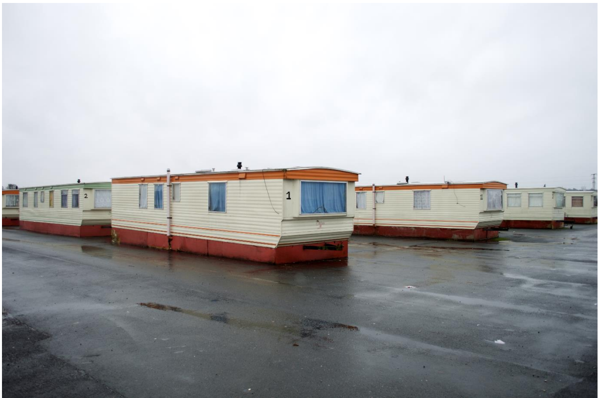
Lissywollen Accommodation Direct Provision Centre, Athlone