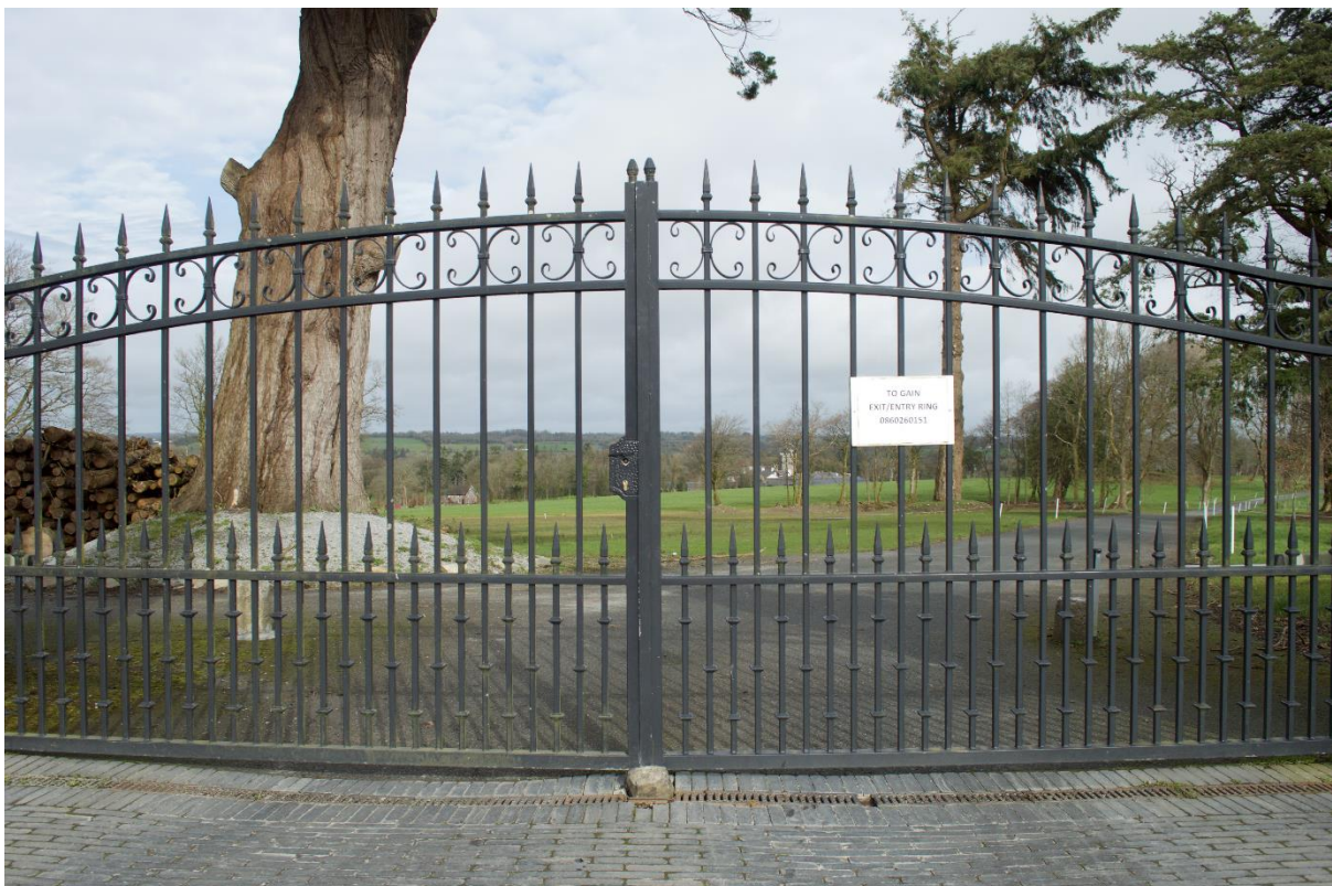
Drishane Castle Direct Provision Centre, Cork