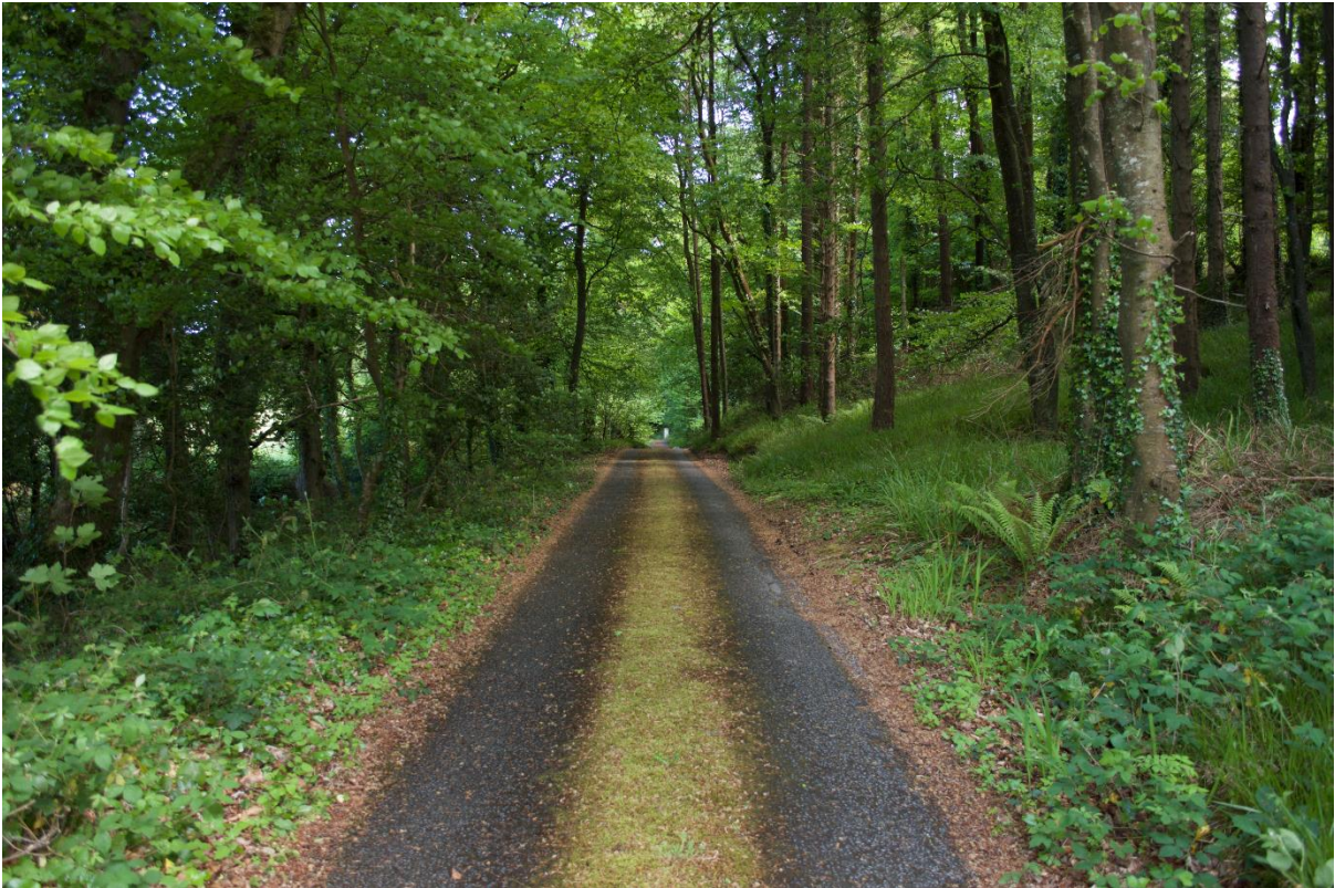
Mount Trenchard Direct Provision Centre, Foynes