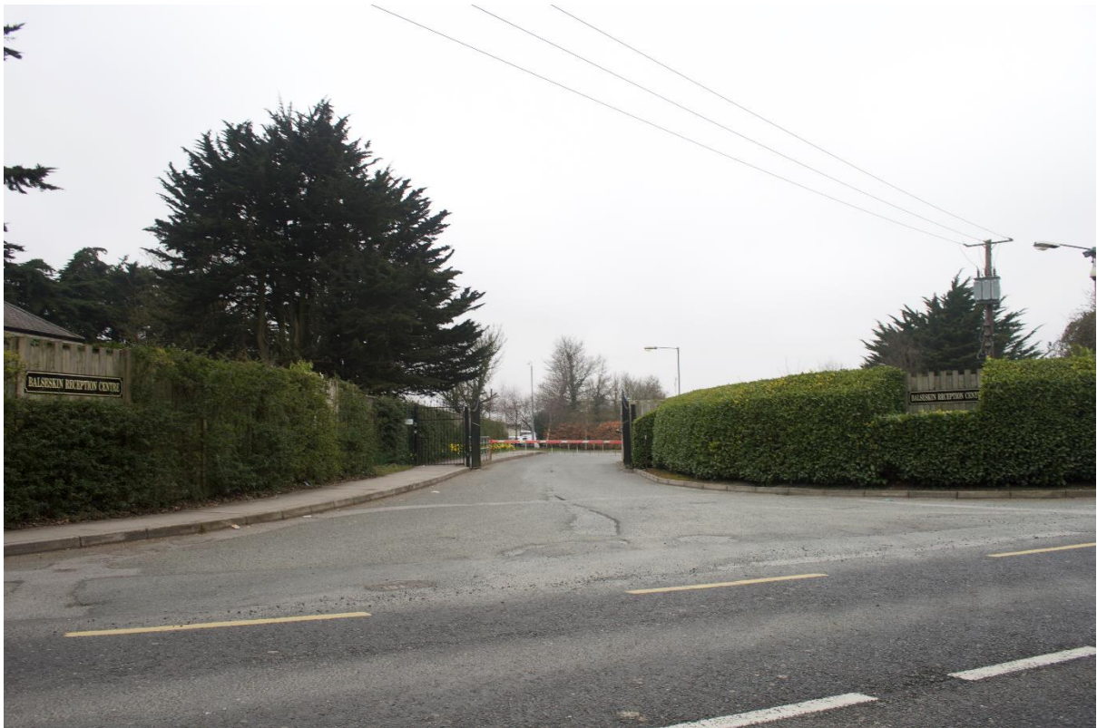
Balseskin Reception Direct Provision Centre, Dublin