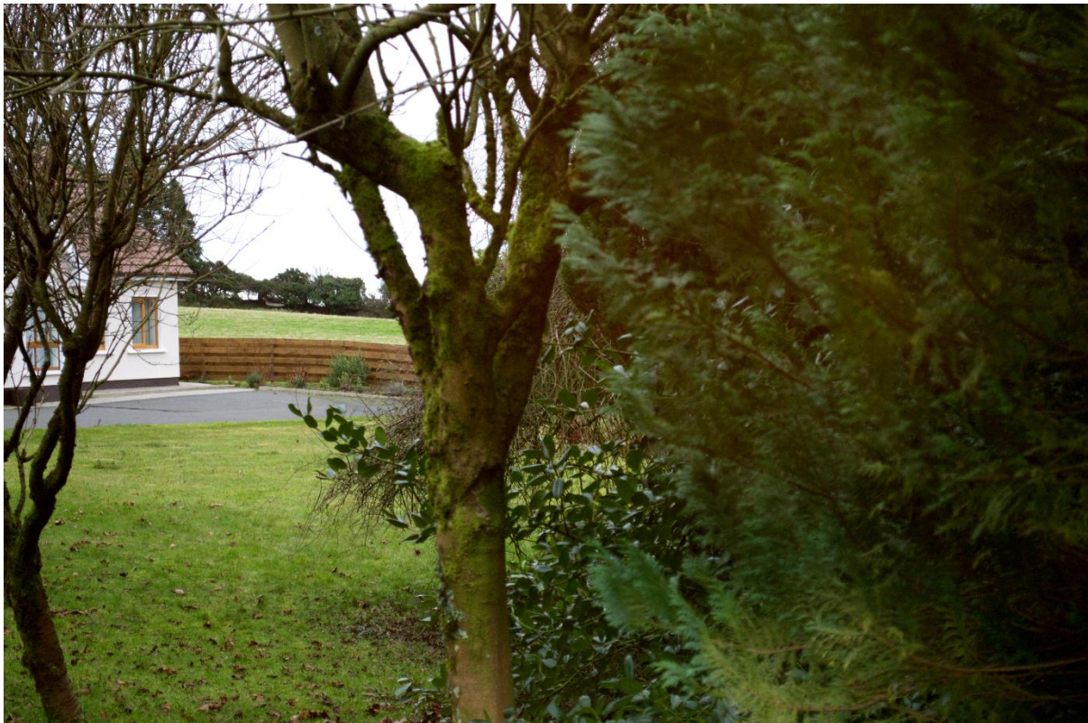
Beechlawn Direct Provision Centre, Wicklow