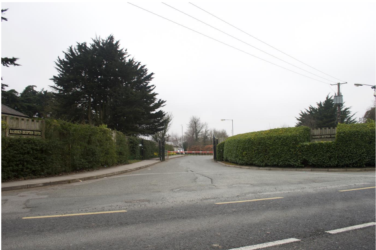
Balseskin Reception Direct Provision Centre, Dublin