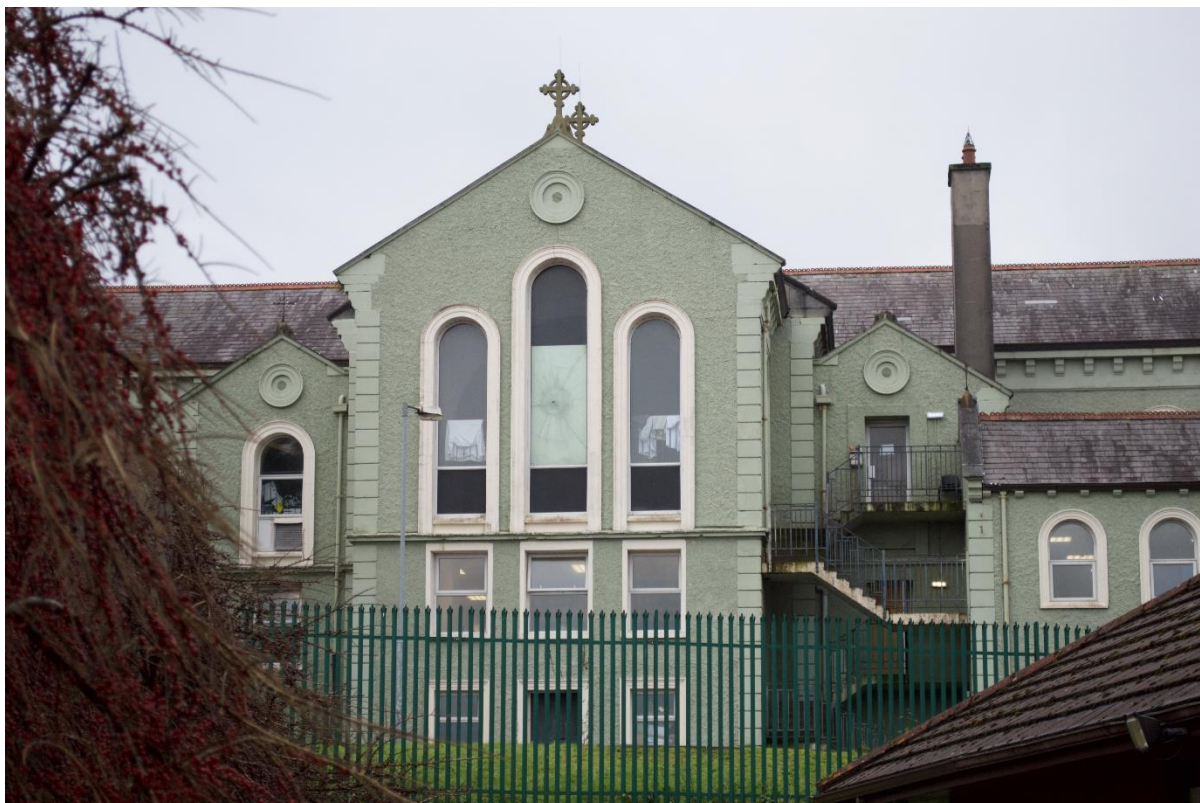
Globe House Direct Provision Centre, Sligo