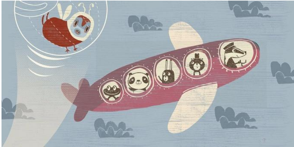
Illustration from Bounce Bounce © Brian Fitzgerald, 2014

Centring the narrative around characters other than humans adds to the appeal of this visual narrative for young readers but may also lends itself to creating a safe distance for any who may have experienced involuntary travel and forced displacement. The alien bounces from page to page (and from one new experience to another) in its protective balloon stimulating the reader's curiosity to turn over the page and see what it will encounter next. In direct contrast to Tan's The Arrival , in Fitzgerald's book it is the protagonist more so than the environment that represents the unfamiliar. Yet, from this inverted perspective of an alien in the reader's familiar environment, here again the reader is encouraged to empathise and imagine what it must be like for a stranger to suddenly experience cultural dislocation, trying to make sense of the unknown. The little alien's sometimes perplexed, at other times surprised, reactions suggest a certain level of vulnerability and bewilderment in this regard. However, despite the forced departure from home and encounters with perceived perils, Bounce Bounce ends with a positive and important message which highlights the traveller's resilience - when the alien's protective balloon finally bursts, it finds that exposure to unfamiliar things and real engagement with his new environment can be a source of delight and wonder rather than a threat.