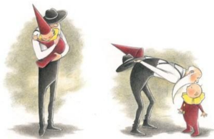
Illustration from The Farmer and the Clown

The story suggests that if we are open in our encounters with others (and Otherness), we have much to learn from one another. Certainly, in this charming visual narrative it is clear that the farmer and clown greatly enjoy each other's company and the young clown's evident joy in being reunited with his own people is tinged with sadness at having to move on and say goodbye. It is also a reassuring tale about the compassion and kindness of strangers as well as the importance of family and friendships.