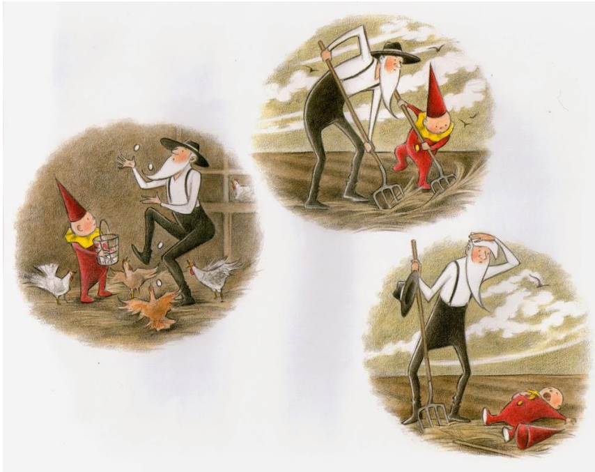
Illustration from The Farmer and the Clown © Marla Frazee, 2014

The story suggests that if we are open in our encounters with others (and Otherness), we have much to learn from one another. Certainly, in this charming visual narrative it is clear that the farmer and clown greatly enjoy each other's company and the young clown's evident joy in being reunited with his own people is tinged with sadness at having to move on and say goodbye. It is also a reassuring tale about the compassion and kindness of strangers as well as the importance of family and friendships.