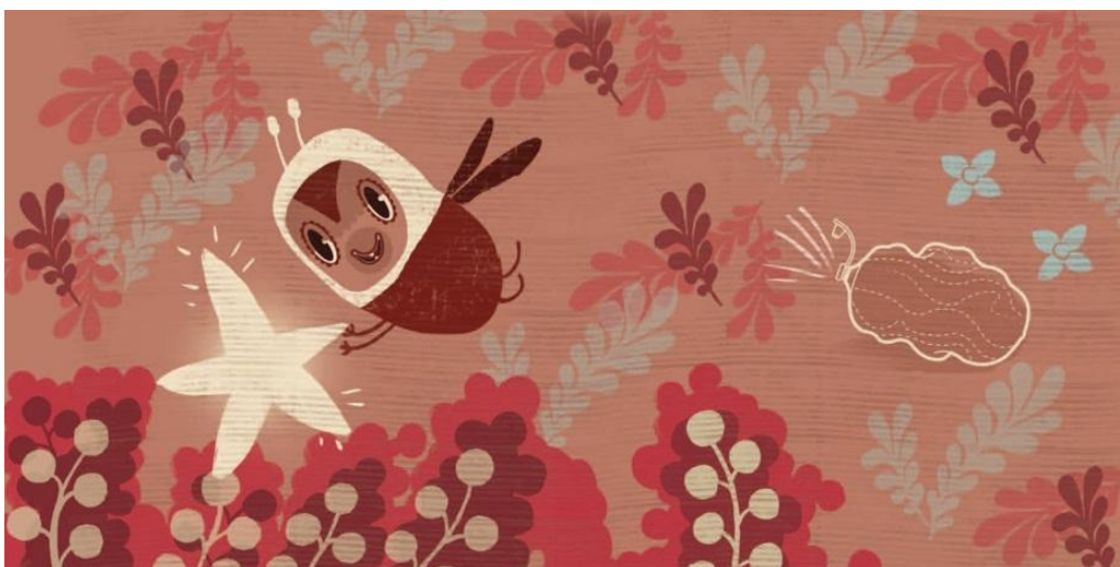
Illustration from Bounce Bounce © Brian Fitzgerald, 2014

Centring the narrative around characters other than humans adds to the appeal of this visual narrative for young readers but may also lends itself to creating a safe distance for any who may have experienced involuntary travel and forced displacement. The alien bounces from page to page (and from one new experience to another) in its protective balloon stimulating the reader's curiosity to turn over the page and see what it will encounter next. In direct contrast to Tan's The Arrival , in Fitzgerald's book it is the protagonist more so than the environment that represents the unfamiliar. Yet, from this inverted perspective of an alien in the reader's familiar environment, here again the reader is encouraged to empathise and imagine what it must be like for a stranger to suddenly experience cultural dislocation, trying to make sense of the unknown. The little alien's sometimes perplexed, at other times surprised, reactions suggest a certain level of vulnerability and bewilderment in this regard. However, despite the forced departure from home and encounters with perceived perils, Bounce Bounce ends with a positive and important message which highlights the traveller's resilience - when the alien's protective balloon finally bursts, it finds that exposure to unfamiliar things and real engagement with his new environment can be a source of delight and wonder rather than a threat.