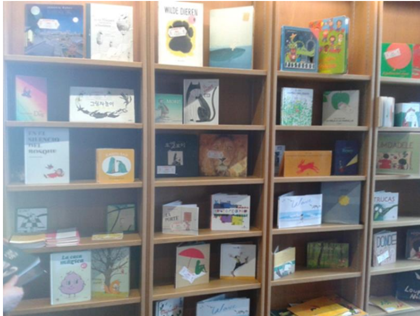
Silent Books Exhibition, dlr LexIcon, 8 May 2017

The exhibition was an absolute gift...For many of the children, the diverse range of books on display proved enormously exciting as many of the illustrators would not be familiar to Irish audiences. Horizons were expanded. 32