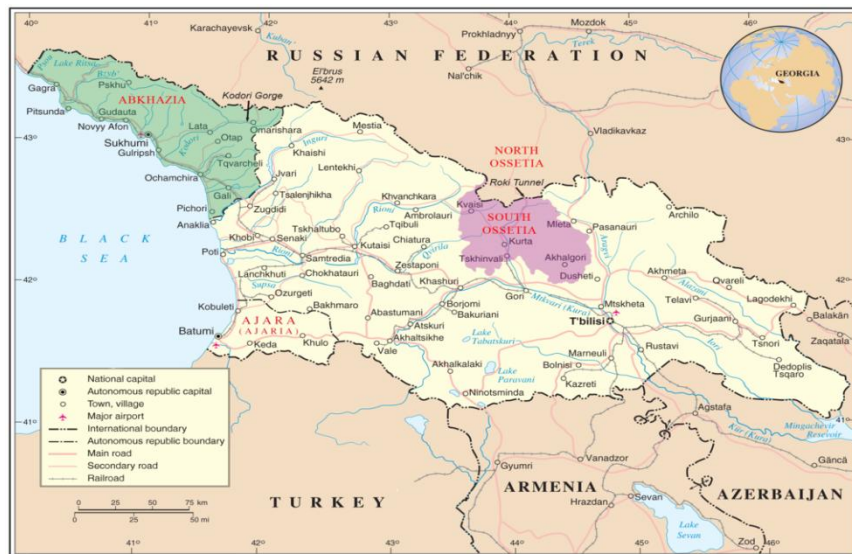
Map 1: Georgian-Ossetian conflict