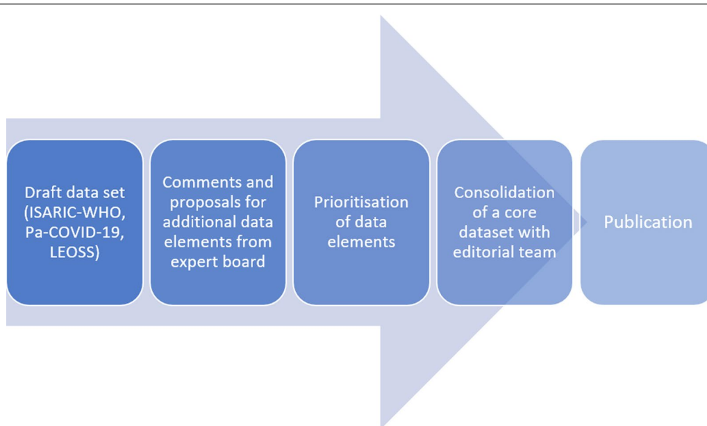
Fig. 1 Workflow of consensus building and definition of data elements for the GECCO dataset

The following terminologies and code systems were used: the International Statistical Classification of Diseases and Related Health Problems, 10th revision, German modification (ICD-10-GM) [15] for diagnoses; Logical Observation Identifiers Names and Codes (LOINC) [16] for laboratory values and other measurements; the Unified Code for Units of Measure (UCUM) [17] for measurement units; the Anatomical Therapeutic Chemical Classification System (ATC) [18] for active ingredients of drugs and medications; SNOMED CT [19] for diagnoses and other medical concepts. We used two terminology systems—SNOMED CT and ICD-10-GM—for diagnoses because ICD-10-GM is the dominant classification system in German healthcare and is important for reimbursement purposes, whereas SNOMED CT allows for a more detailed coding of clinical terms and is therefore preferable for better medical accuracy. The annotation of data elements with international terminologies was done using ART-DECOR [20], an open source collaboration platform for experts from medical, terminological and technical domains aiming on creation and maintenance of datasets with data element descriptions, use case scenarios, value sets and Health Level 7 (HL7) templates and profiles.