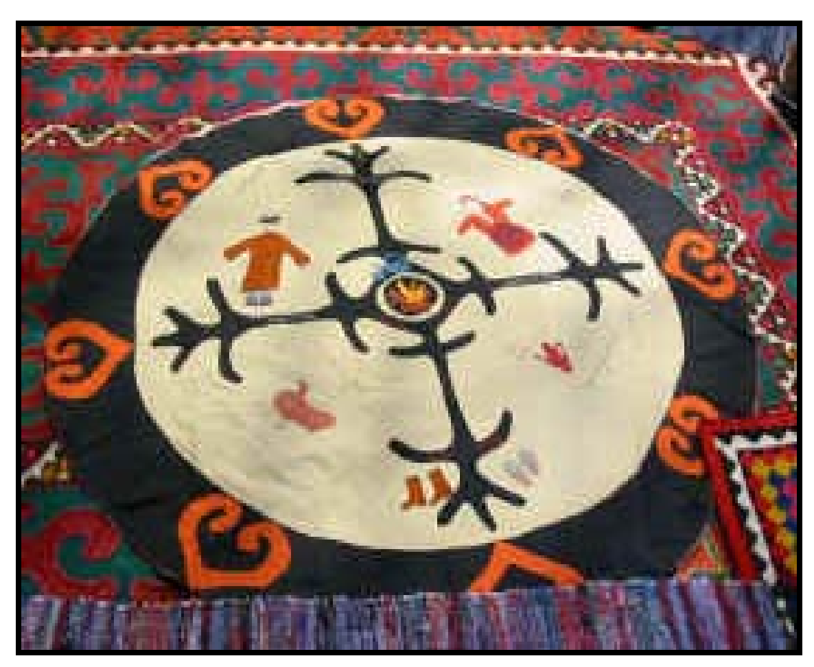
A Kyrgrz Table Cloth: One side depicts a woman, the other, a man. On her side is a cooking tool and on his, a saddle.

OPEN SOCIETY INSTITUTE NETWORK WOMEN'S PROGRAM