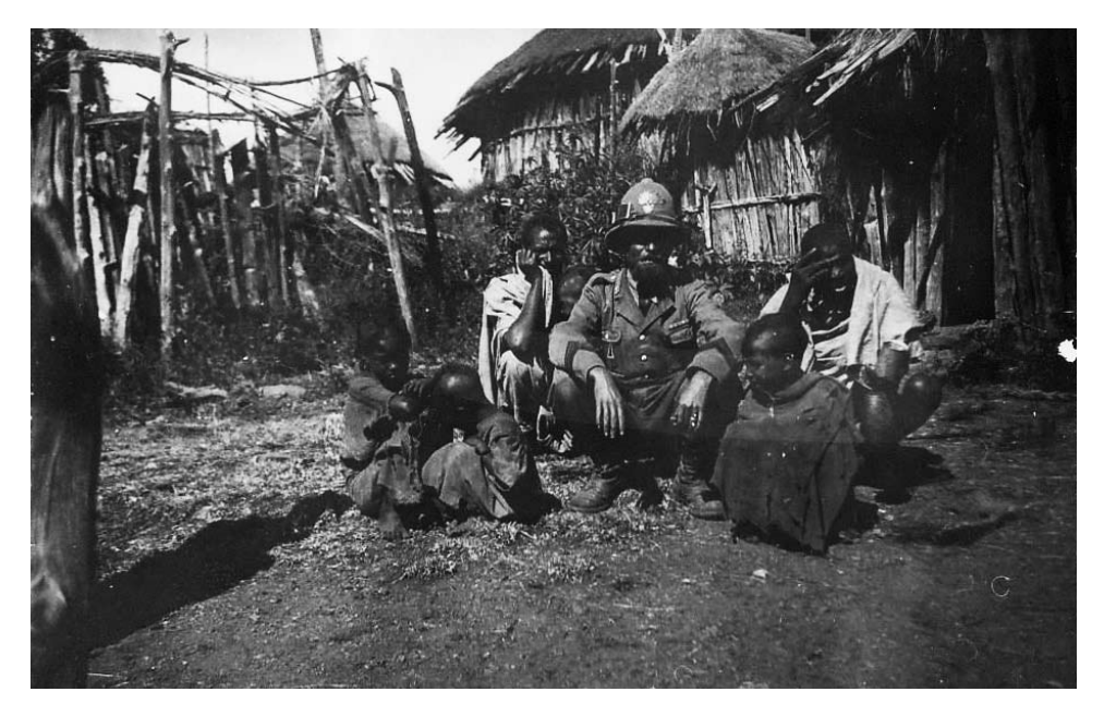
Figure 4: Ethiopia, 1936.

In this paper I examine some key concepts of the representation of the female body in Italian orientalist painting. We can use these concepts as a starting point to discuss in the classroom the roles that imperialism and colonialism play in orientalist painting and, where possible, to capture the complexity of Eastern women's condition within a painting. We can suggest that students compare these images of women with images in other imperialist contexts (for example, British and French contexts) and explore what makes these representations so popular and how these paintings influenced images of Eastern women in literature, film and advertising.