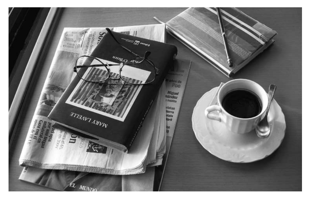
Figure 1: 'Mary Lavelle'

The aim of this article is to provide evidence of how the imperialist idea is so well intertwined with the notion of patriarchy that it can construct women both as passive or active, but always within its realm. Broken English is an example of the former, and the nannies in Mary Lavelle of the latter. This proposition is backed with such criticism as seemed appropriate to the target class: undergraduate students. Even so, the argument can be easily adapted to secondary school students.