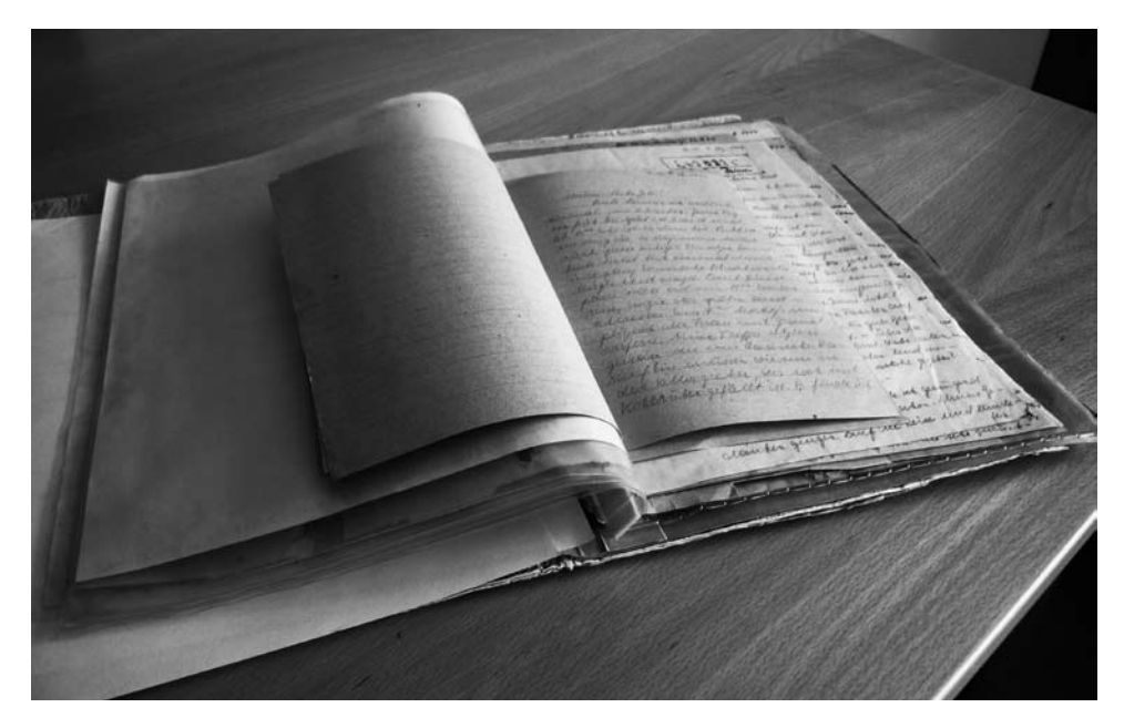
Figure 5: 'Autobiographical material'

The history of the Nazi empire and its horrible outcomes are very well known. As a result, as a university teacher – especially in Germany but also in other European countries – one can assume that students already have a substantial knowledge about this period of time. Furthermore, for students in history National Socialism (NS) is part of their regular studies. As a result, in Gender Studies one might have a class with very different stages of knowledge. Sometimes, this knowledge is phrased in discursive routines concerning how to negotiate this past. Such negotiation differs according to one's individual political attitude, in relation to one's family memory and from country to country. As a consequence, the issue is less to teach the empire as such but rather to make nuances visible and show the relationship between the past and its cultural memory.