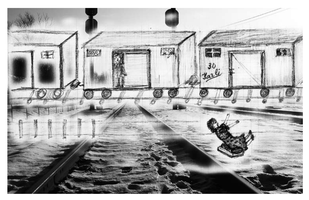
Figure 6: Photograph by Leena Kurvet-Käosaar, inset drawing by Evi Tallo, an Estonian woman deported in 1941 and again in 1950.

The impact of political regimes of a totalitarian nature does not pass with their coming to an end but forms complicated grids of memory, often attended by specific and limited perspectives, under the new socio-political and ideological frameworks. One of the common limitations of the construction of memory frames in formerly occupied/colonized countries is the underrepresentation or misrepresentation of women's experience. Viewing the Soviet regime as colonial in nature, including its means of securing the domination of the regime via extensive penal frameworks, I wish to highlight Baltic women's modes of remembering of the repressions of the regime, focusing in particular on the possibilities of representing the traumatic quality of that experience. My discussion relates to the key concepts of the book, those of gender and empire by, on the one hand, elaborating why women's (full) experience of colonialism