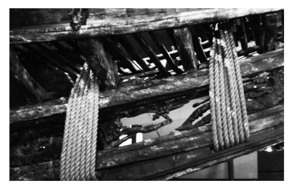
Figure 2: Ropes and Timber (at the Vasa).

When you start thinking about museums and their relationship to empires of different kinds it soon becomes clear to you (if you did not know it already) that museums are very important to empires. Without museums or comparable institutions there could be no empires, since a very important part of being an empire is displaying yourself as a great nation, if not the great(est) nation. And the same goes for museums – much of what makes a museum a museum is related to the fact that the story of the museum as an institution is closely related to the history of the nation state and European imperialism.