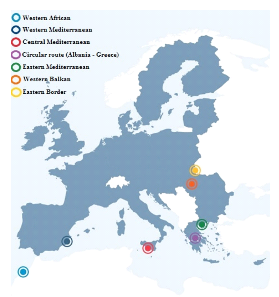
Figure 1. The main routes used by migrants to enter the European territory

origin.<sup>10</sup> In this context, Italy is located on the first line of the Central Mediterranean route, with most migrants from Libya entering Europe via Lampedusa island in southern Italy, which has become the entry portal to Europe and one of the most popular migrant centres.<sup>11</sup>