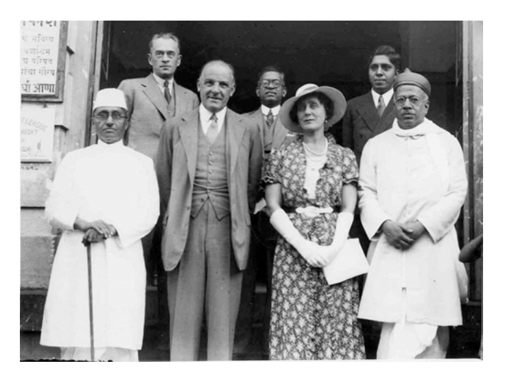
Photo 8: Harold Butler's Visit to the Headquarters of the National Trade Union Federations, Bombay. 1937.