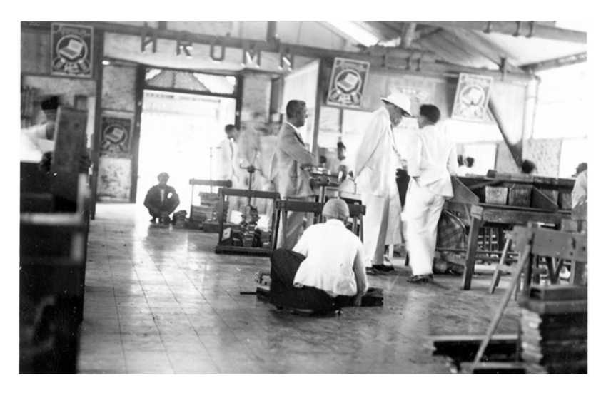
Photo 9: Harold Butler, Director of the International Labour Office, visits the cigar factory "Aroma" near Magelang, Java. 1937. ILO historical archives.

Photo 8: Harold Butler's Visit to the Headquarters of the National Trade Union Federations, Bombay. 1937. ILO historical archives.