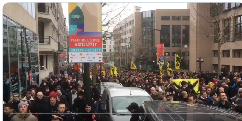
Figure 3. Tweet with a video of demonstrators against the GCM.

Europeans have had enough of mass-immigration!