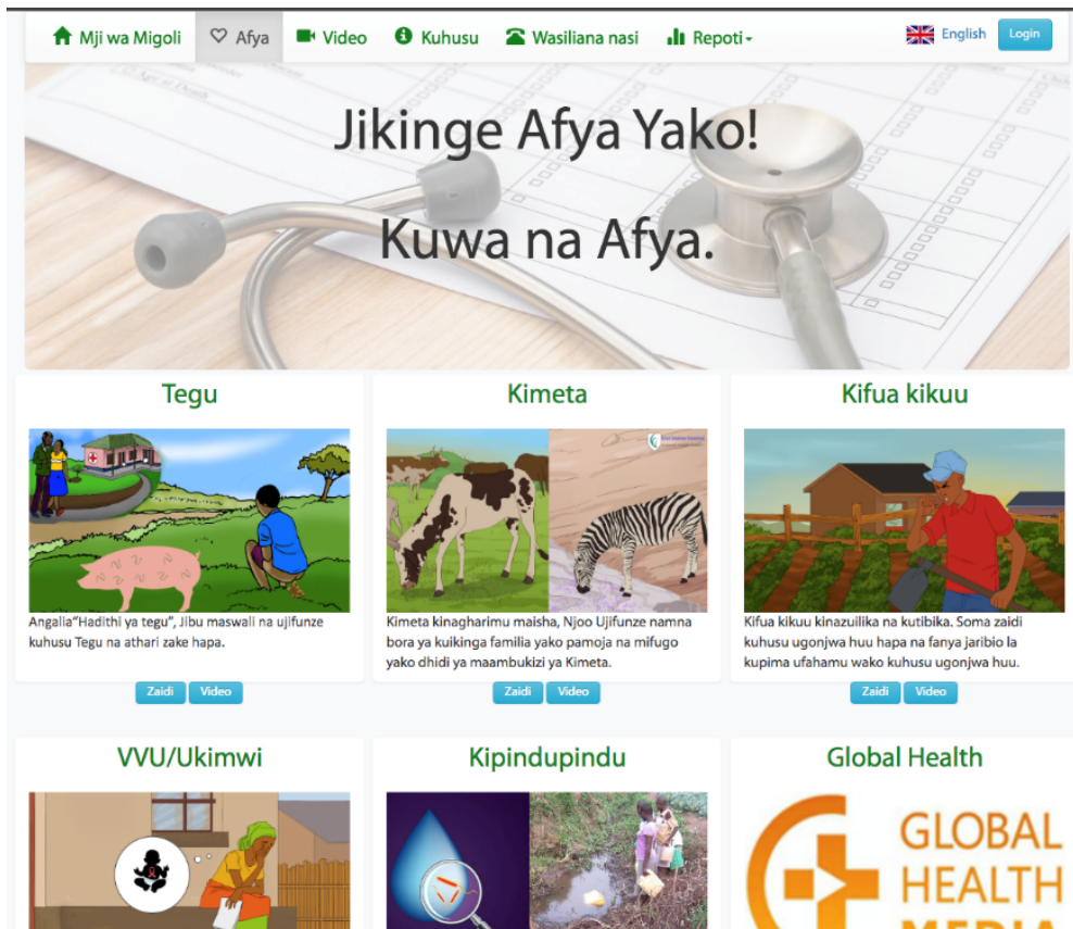
Figure 1. Screenshot from the web prototype developed in the DigiI project.