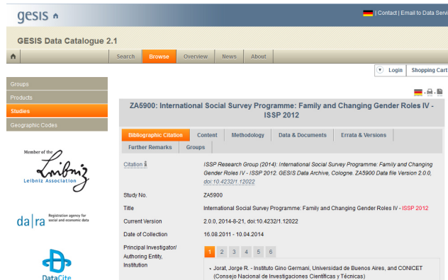
Fig. 2. Detailed view of a data set.

When searching, author names, a kind of information users of our literature system often search for, are not used. Although these insights already exposed some information about the differences of literature and data set retrieval, we decided to perform more detailed user studies based on semi-structured interviews to get a clearer picture on the information seeking process and the users' intentions themselves.