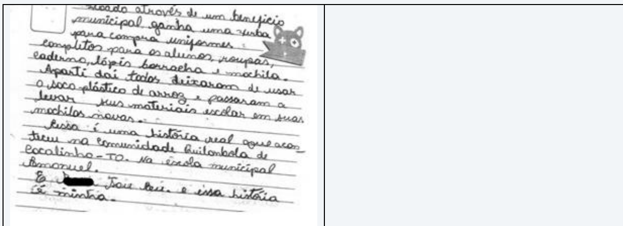
Source: Produced by the student R2.

As it can be seen, the sociocultural context of the student reflects the sociocultural conditions to which peasant students are subjected. In addition, the student reports a real story, lived by her while attending school, ruled by great difficulty and numerous challenges that did not make her give up her studies, contrary to what happens with most young people and peasants .