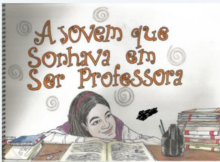
Figure 1 – Excerpt from a comic story produced by the student E5.

This is what the comic book produced by E5 is about and presented as it follows: