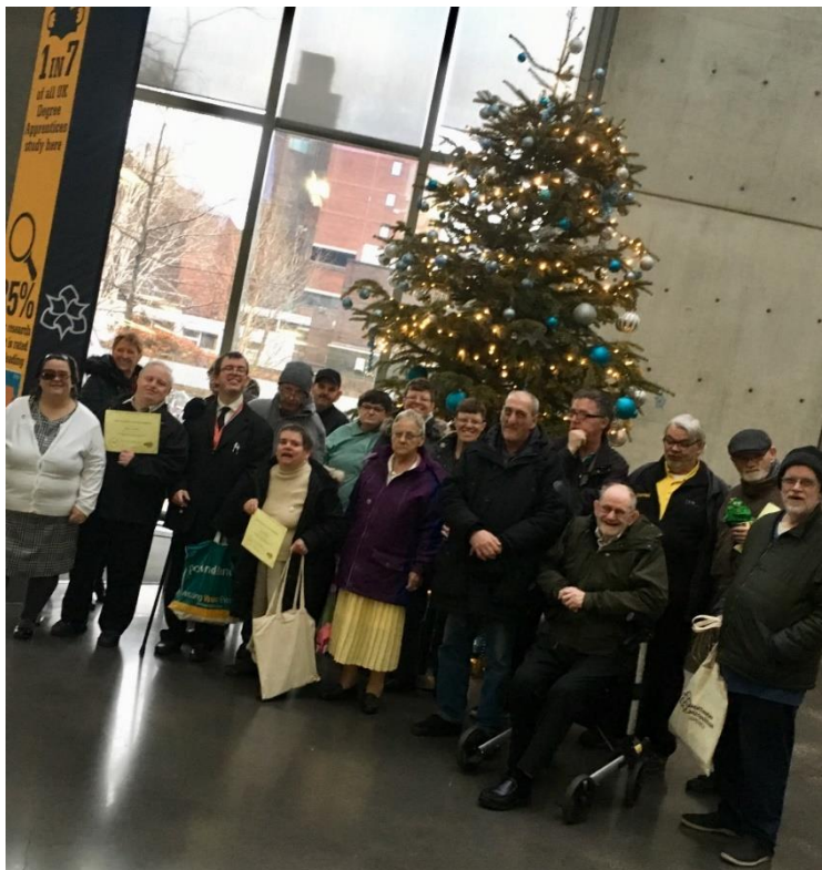
The Greater Manchester Growing Older with Learning Disabilities (GM GOLD) team

Ambition for Ageing is part of Ageing Better, a programme set up by The National Lottery Community Fund, the largest funder of community activity in the UK. Ageing Better aims to develop creative ways for people aged over 50 to be actively involved in their local communities, helping to combat social isolation and loneliness. It is one of five major programmes set up by The National Lottery Community Fund to test and learn from new approaches to designing services which aim to make people's lives healthier and happier.