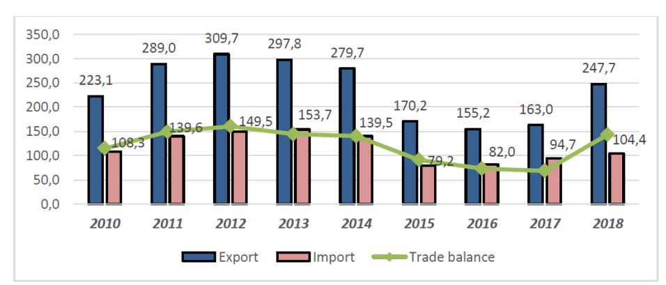
Figure 2. Dynamics of the EEU's (Customs Union's till 2015) export and import with the EU (billion $)