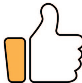
Provide and save resources