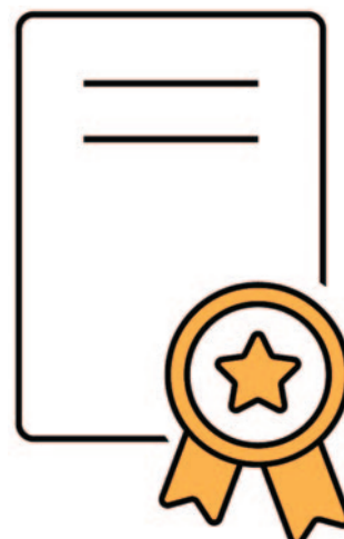
Build knowledge and skills

An engagement opportunity may be more attractive when citizens do not fear they lack the necessary knowledge and skills for the engagement process. For organisations that engage with the public it is advisable to combine dialogue and information in engagement processes, and to use information and attractive stimuli to support dialogue. More generally, policy makers and governments can contribute to building knowledge and skills by promoting scientific literacy of society as a whole. One option is to strengthen science journalism by making it an integral part of the education of journalists at universities. Governments could also embed engagement more widely in the educational systems. Teaching on civic engagement and engagement in research can be included in classes on science, citizenship or similar subjects in secondary schools. This can promote citizens' awareness, interest, and willingness to be engaged in scientific debates from an early age.