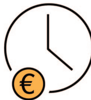
Provide and save resources