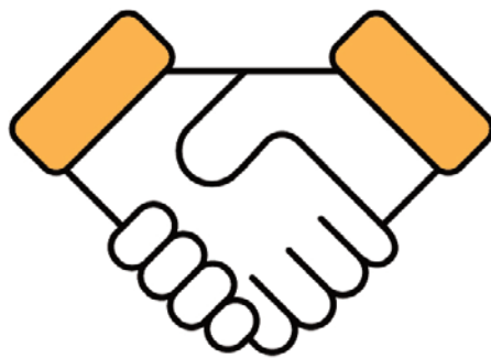
Build trust and mutual understanding

RRI calls for the engagement of civil society organisations, and also of individual citizens in research-related activities. What motivates or hinders members of the broader public to engage in research? This article identifies important barriers to societal engagement and presents policy and practice options to lower these barriers. The work identifying these barriers and possible ways to address them are the result of the EU-funded project PROSO. The project has shown that citizen engagement in research is not just a question of time and opportunity but also of relevance, trust, legitimacy, and impact.