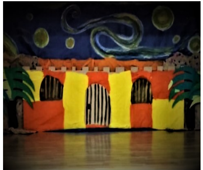
Figure 1. A snapshot from the beginning of the theatrical performance.

Based on the observation, the formal and informal interviewing as well as the result, the organizational process was considered satisfactory. It was especially important that students could manage their research spirit, that they were able to work in groups, as well as to understand the concept of teamwork. What made the whole process difficult was the limited time, and for this reason the next time the tasks will be divided even more (Figure 1).