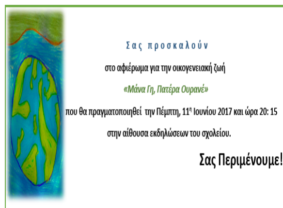
Figure 5. The invitation

Also, the advertising campaign stage allowed children to express themselves artistically and release their imagination to create posters and invitations. At the same time, it strengthened the organizational skills and relationships of the group (Figure 5).