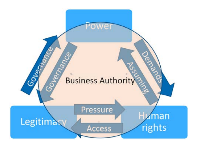
Figure 2: The triad of business authority