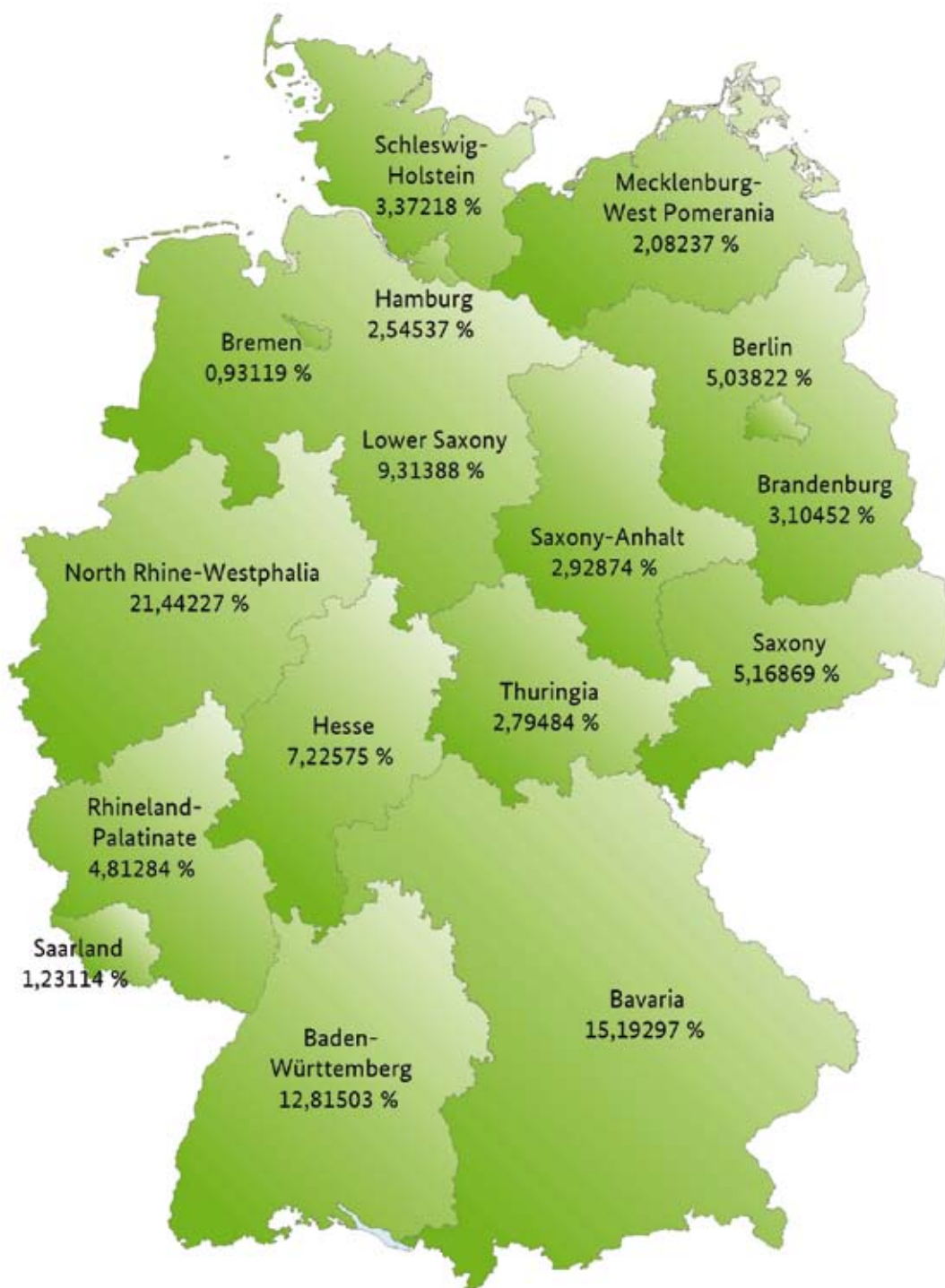
Figure 1: Reception quotas of the Federal Länder for 2012