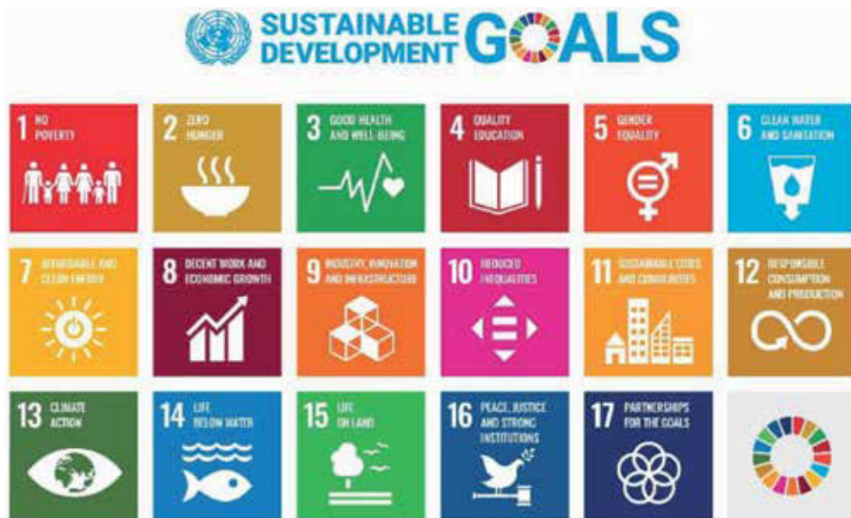
Figure 2. The 17 sustainable development goals [3].

The UN SDGs aim ambitions and necessary targets across a wide range of socio-economic, environmental, and governance issues in order to reduce the significant gaps between high-income countries and emerging economies in terms of population access to critical services (health, education, public utilities, infrastructure) and to limit the extreme poverty among the most vulnerable populations from Asia, Africa, Latin America, or Eastern Europe.